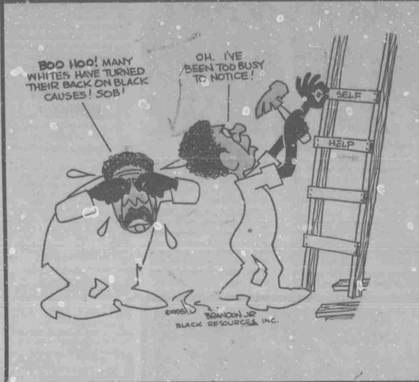
Dr. Manning Marable "Along The Color Line"

Contemporary History: For a free two year subscription to the Southwest Digest, name the local person who for a six month period received more coverage (ink) in the local daily than Mikhail Gorbachev, one of the persons responsible for changing the face of the world during the same time frame. First postmark wins!!