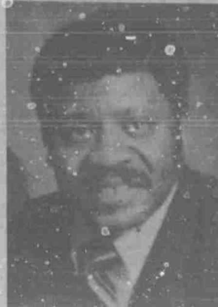
T. J. Patterson Mayor Pro Tem

The public and supporters of Mayor Pro Tem T. J. Patterson are invited to attend a District Two Political Rally set for Friday night, March 27, 1992 at Bethel African Methodist Episcopal Church, 2202 Southeast Drive, the church home of Patterson.