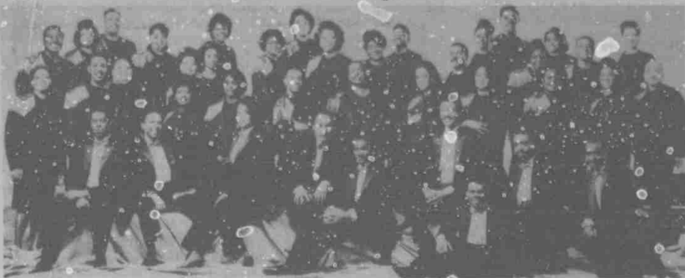
Sounds of Blackness