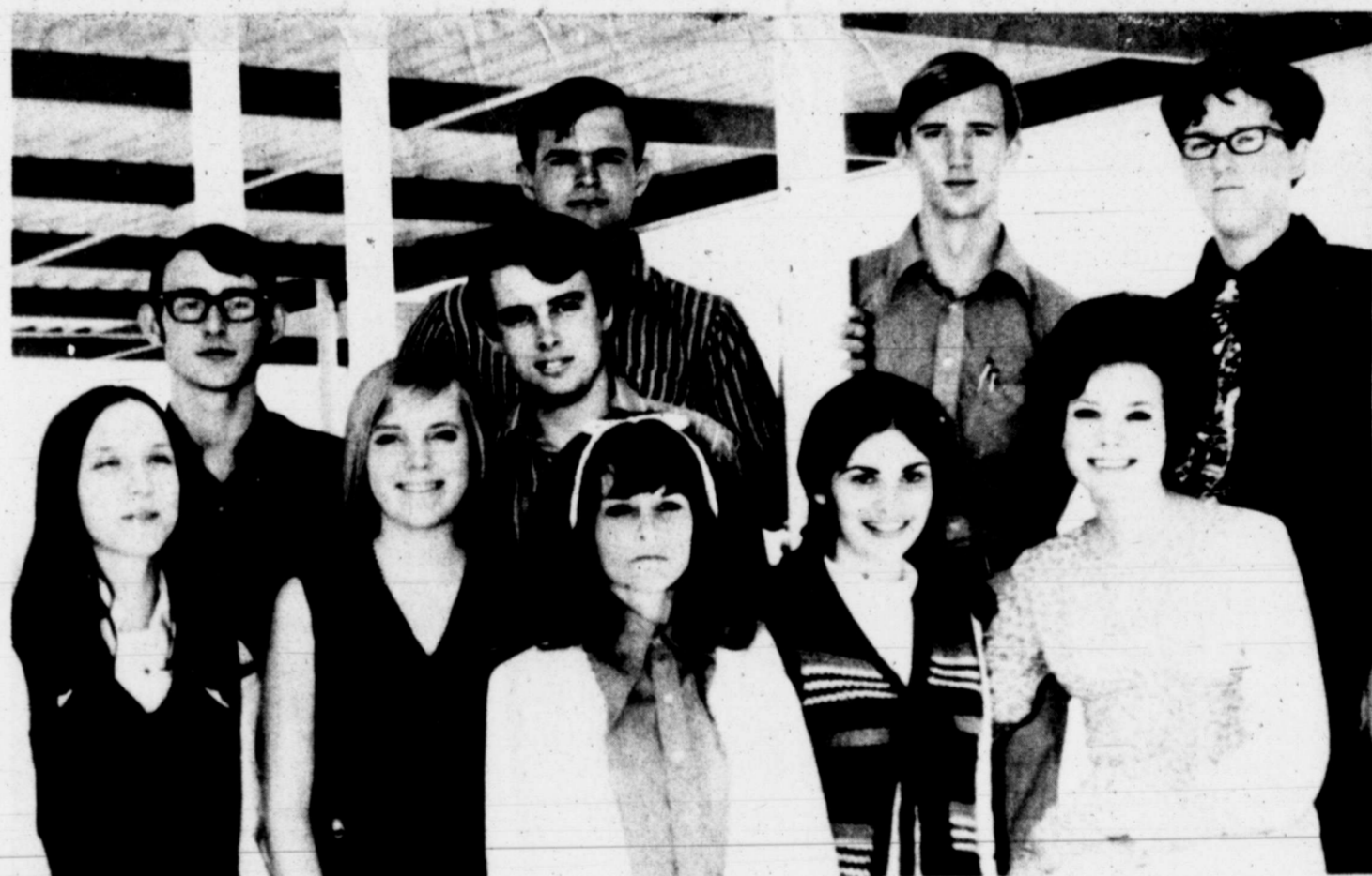
Scholastic Leaders For Seniors

The 11 "graduates" and the 26 other adults receiving GED recognition Thursday night for educational advancement attended classes Tuesday and Thursday nights in Colorado High beginning early last fall.