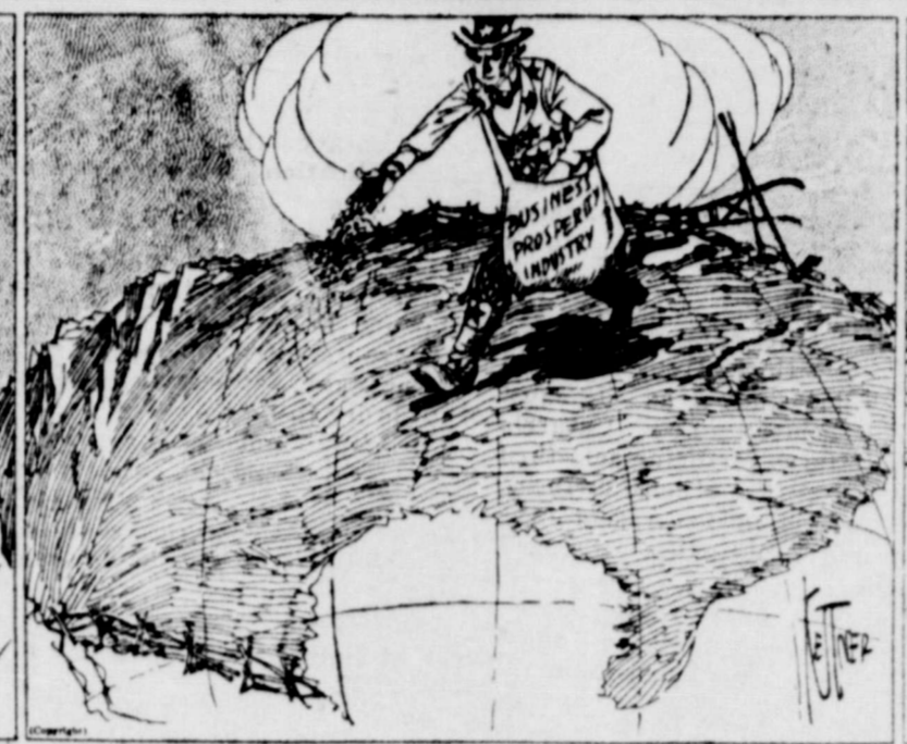
As Ye Sow