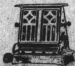
More than 20 slices of Toast

Consider the values of everyday electric services, some of which are illustrated below. Electricity is cheap—use more of it.