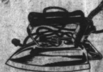
More than 1/3 hour