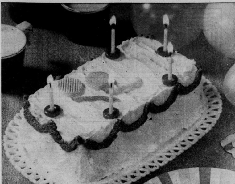
FUN TO THE LAST BITE —is this Surprise Birthday Cake that hides chocolate and vanilla ice creams under a whipped cream frosting.