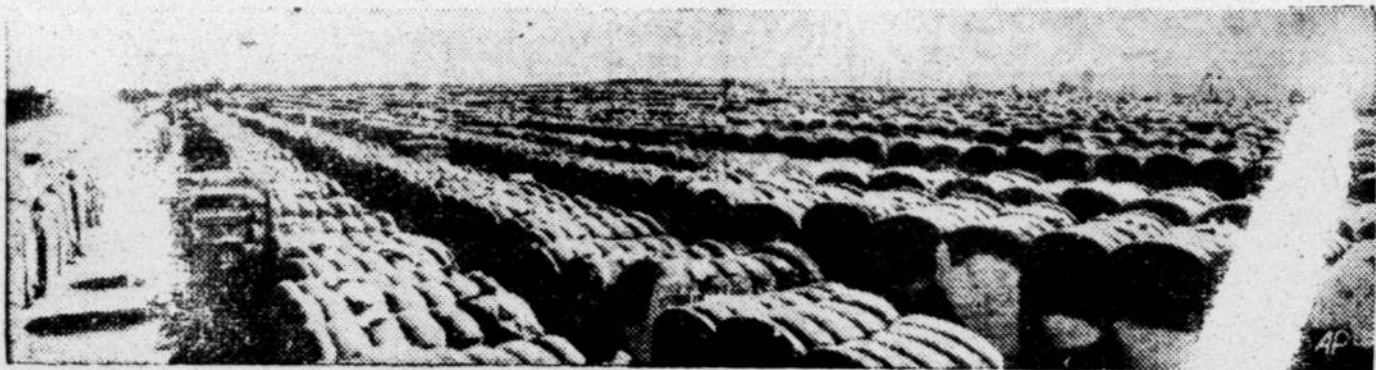
BUMPER COTTON CROP — West Texas' bumper cotton crop has created a storage problem. Above, is a scene at Big Spring where storage is needed for 40,000 bales so farmers may apply for loans.