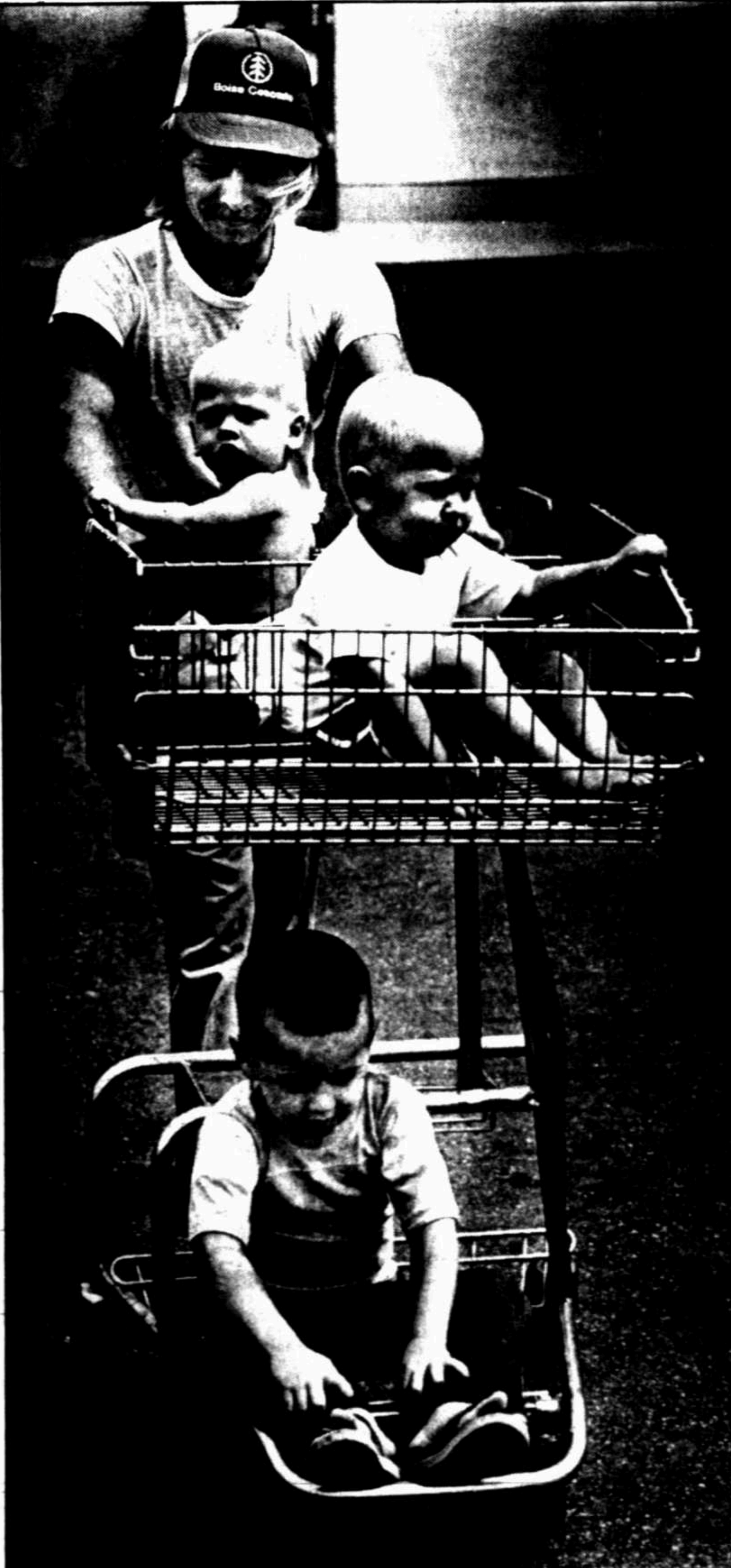
Shopping for babies