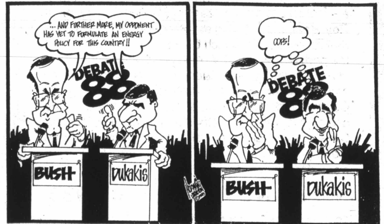
WAKE UP AMERICA!... Our candidates are evading the issue!

Tickets are $3.00 for everyone. For reservations contact the Playhouse, (915) 362-2329.