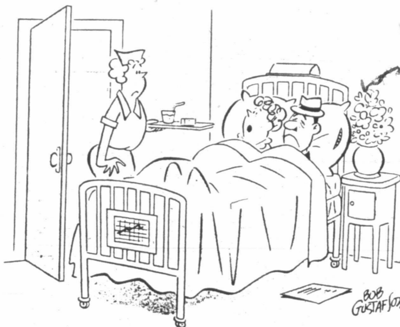
"HE JUST SAW MY BILL!"

Thanks to the 1988 football team for the shutout. CLASS OF '79