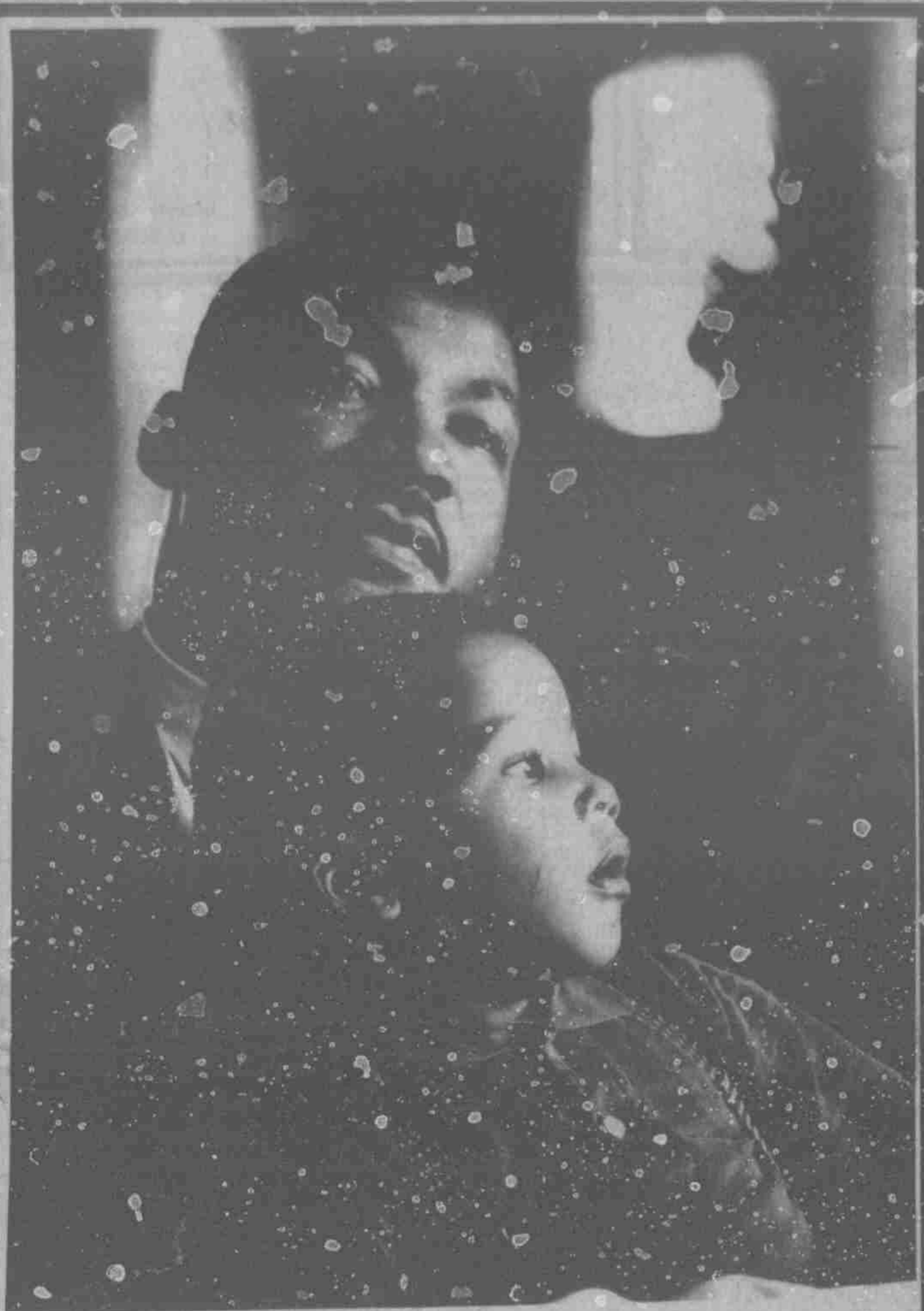
MLK with his son Dexter Scott, at home in Atlanta, April 9, 1964

"I have a dream that one day... little black boys and black girls will be able to join hands with little white boys and white girls and walk together as sisters and brothers."