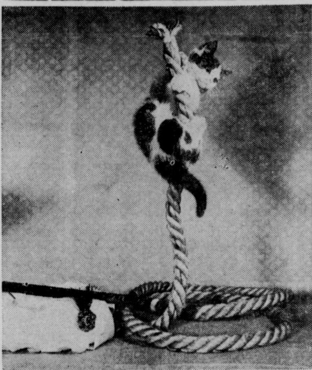
Backstage of a London theatre, while the magician was out to lunch, Tinker, the house cat, had a go at the Indian rope trick. Made it work, too—proving that some cats are smarter than people.