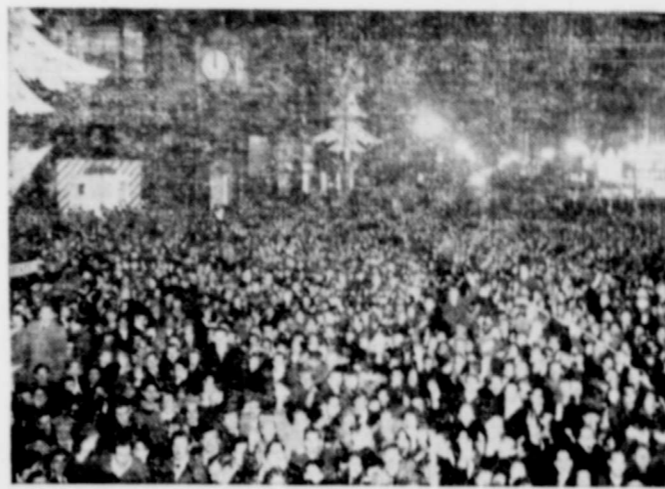
WELCOME NEW YEAR . . . New York's Times Square isn't the only famous location that becomes crowded with merrymakers waiting to welcome the New Year. The photo above shows crowd gathered at State and Randolph Streets in Chicago. Despite often near-zero weather, Chicago's Loop is crowded with people who came downtown to welcome a New Year.

Following the parade, CHANNEL THREE will present color coverage of the Sugar Bowl Game in New Orleans in which the University of Mississippi opposes the University of Alabama (12:45) and the Rose Bowl Game between the University of Illinois and the University of Washington (3:45)