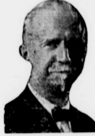
ROGER W. BABSON

The Burk Burnett Star will publish Roger W. Babson's BUSINESS AND FINANCIAL FORECAST for 1964 on Thursday, January 2, 1964.