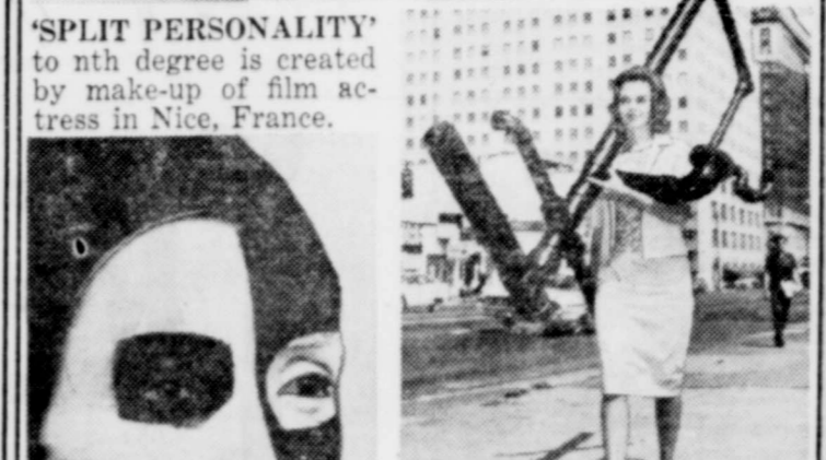
'SPLIT PERSONALITY' to nth degree is created by make-up of film actress in Nice, France.