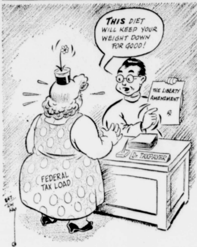
A Diet Badly Needed

will watch with interest those elected as conservatives and how they vote on this matter. As for the liberals, who control both houses of Congress, they will put it through. In 1789 the first members of Congress were paid $6 a day for every day they attended. The lawmakers paid their own travel expenses, meals, lodging and incidentals."