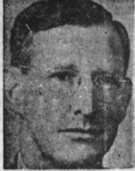
By DICK O'BRIEN