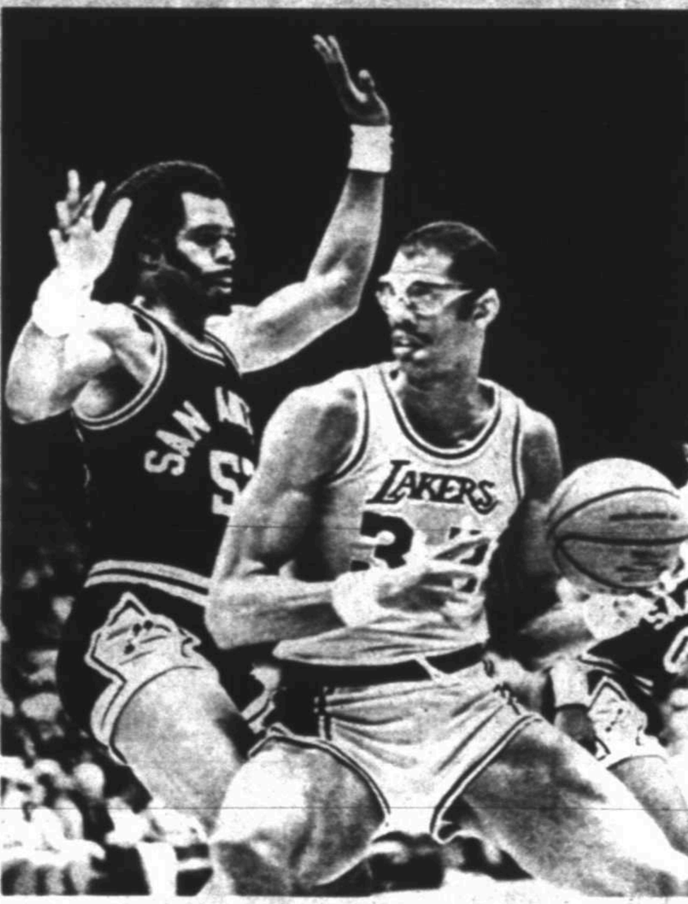
The big battle in the Spurs, Lakers NBA series is between Artis Gilmore and Kareem Abdul-Jabbar.

It was the first appearance for the reserve forward-center since he dislocated a toe on his right foot in practice Feb. 16. The Lakers had been thin in the frontcourt since McAdoo was hurt and rookie forward James Worthy went out with a broken leg.