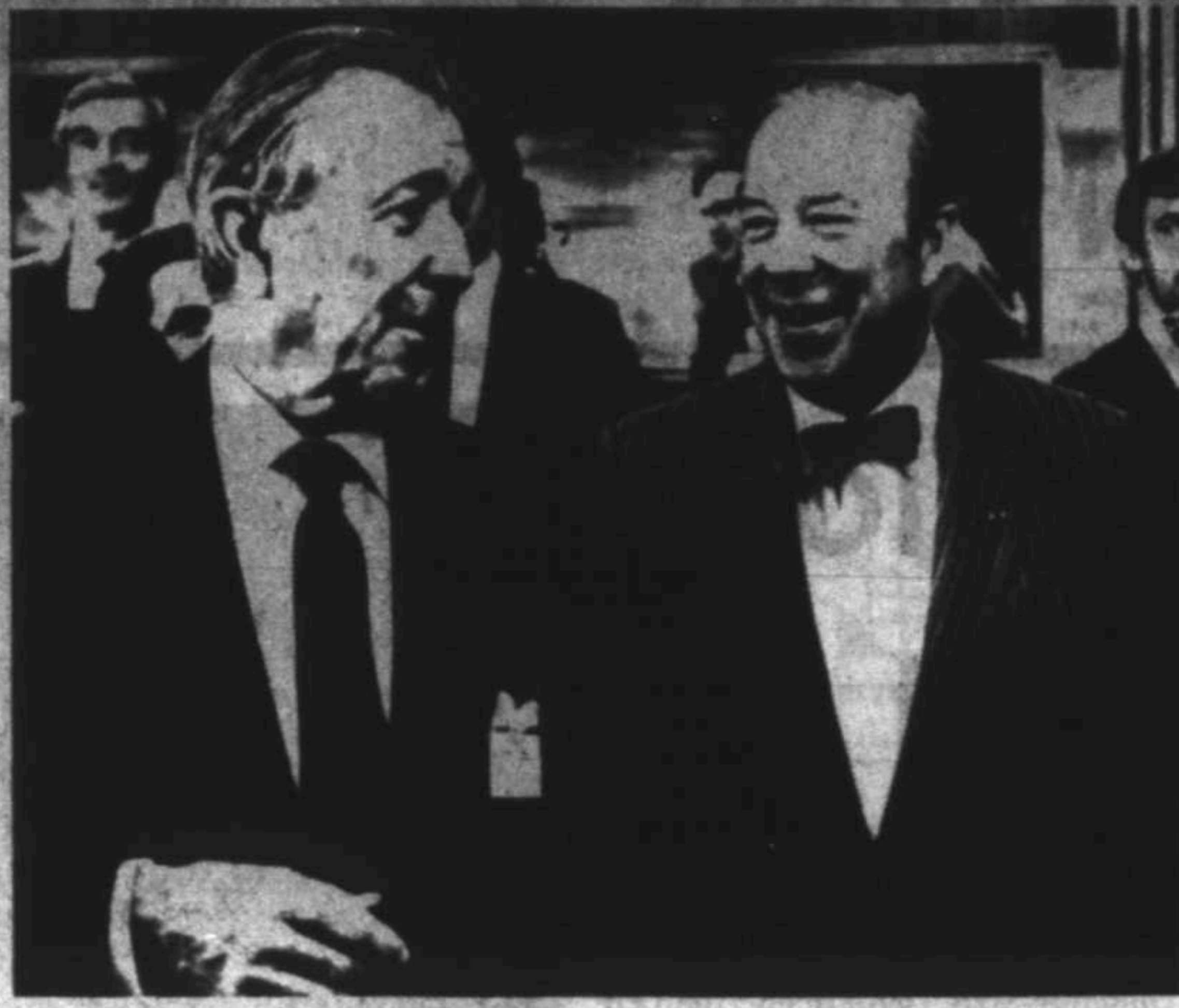
U.S. Treasury Secretary Donald Regan, left, and Secretary of State George Shultz confer before opening of the second session of ministerial talks under way in Paris.

In contrast to Mitterrand, U.S. Secretary of State George P. Shultz conveyed the Reagan administration's optimistic economic outlook to the ministers. He also urged allies to