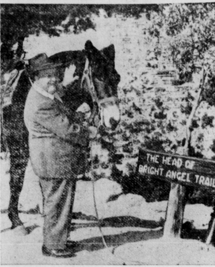
SITE OF HIS INSPIRATION —Famed composer Ferde Grofe and a hired mule are having a look at the Grand Canyon National Park in Arizona. This is the setting made famous in Grofe's Grand Canyon Suite, which made Grofe famous too.