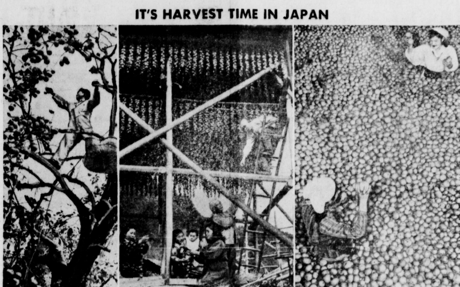
UP AND AT 'EM—Farmers near Tokyo are gathering persimmons and mandarin oranges for shipment to market. While a companion uses a pronged stick to gather fruit from lower branches, left, one man goes aloft to gather persimmons. When full-grown, the trees are 60 feet or more in height. Whole families pitch in when the newly-picked fruit is hung in a drying shed, center photo. In between chores at a giant mandarin orange orchard, some girls can't resist the urge to crawl into a bin-full and let fly with a few, right. These oranges, known in the western world as tangerines, have been grown in Japan for centuries, although they originated in southeastern Asia. This year's harvest has been particularly good in the Orient.