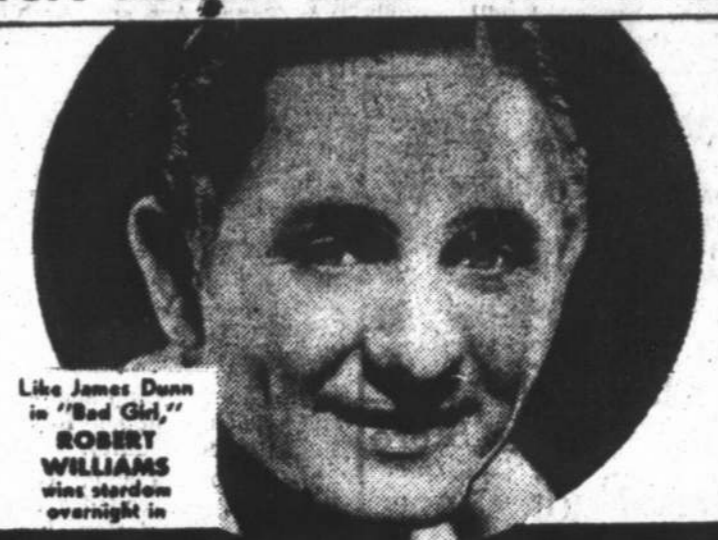
Like James Dunn in "Bad Girl," ROBERT WILLIAMS was stardom overnight in