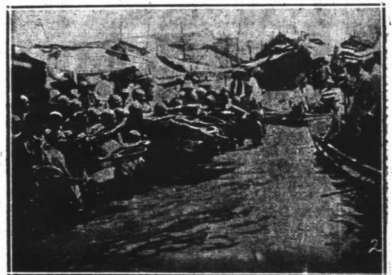
Starving flood sufferers rush into water to get food.