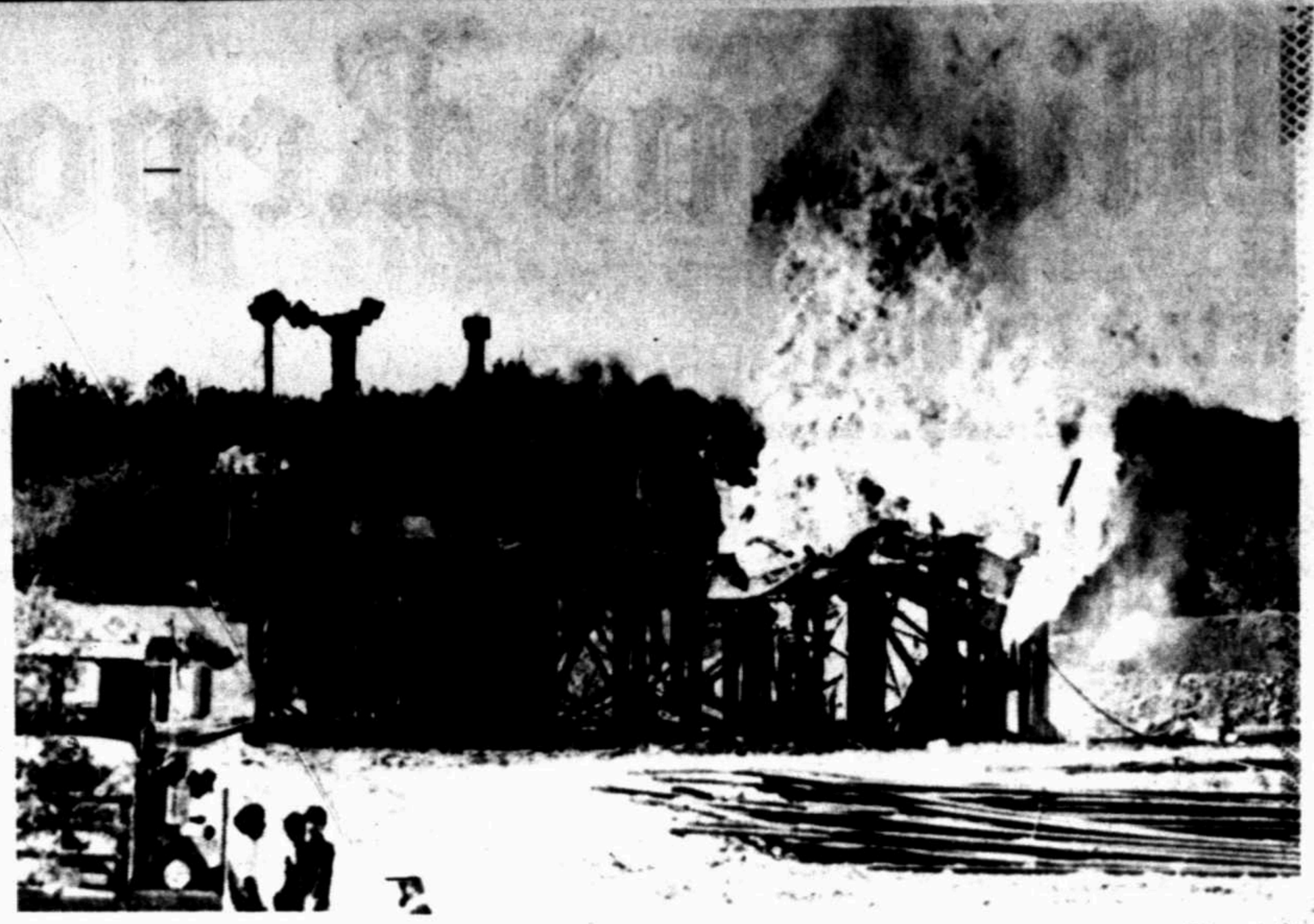
The twisted remains of a natural gas drilling rig an explosion and fire Wednesday morning. Three located near Sonora continue to burn following crew members were burned.