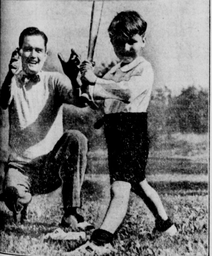
Best likenesses, and a "story idea," make this picture a fine example of a good informal portrait snapshot.

Two family album or picture collection should include good informal portraits of the family's members. But many amateur photographers do not know how to make informal portraits, or realize that these differ from other popular types of pictures. The first place, an informal portrait should resemble a formal portrait. They are entirely different, and, as a matter of fact, an informal portrait can be taken better by a professional photographer who has a well-equipped studio with proper lighting equipment and a sound technical knowledge of photography. Two main requirements of a formal portrait are, first, a likeness of the subject or subject, and second, a suggestion of a "story idea." In fact, the informal portrait is closely akin to the "story idea" type of snapshot. To obtain a good likeness, indoors, you need a nicely lighted subject's face. In particular, that "contrast." Indoors, such a likeness is easily obtained by using