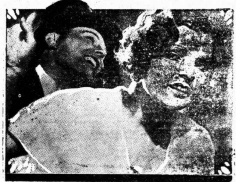
Scene from "BE MINE TONIGHT" UNIVERSAL SPECIAL