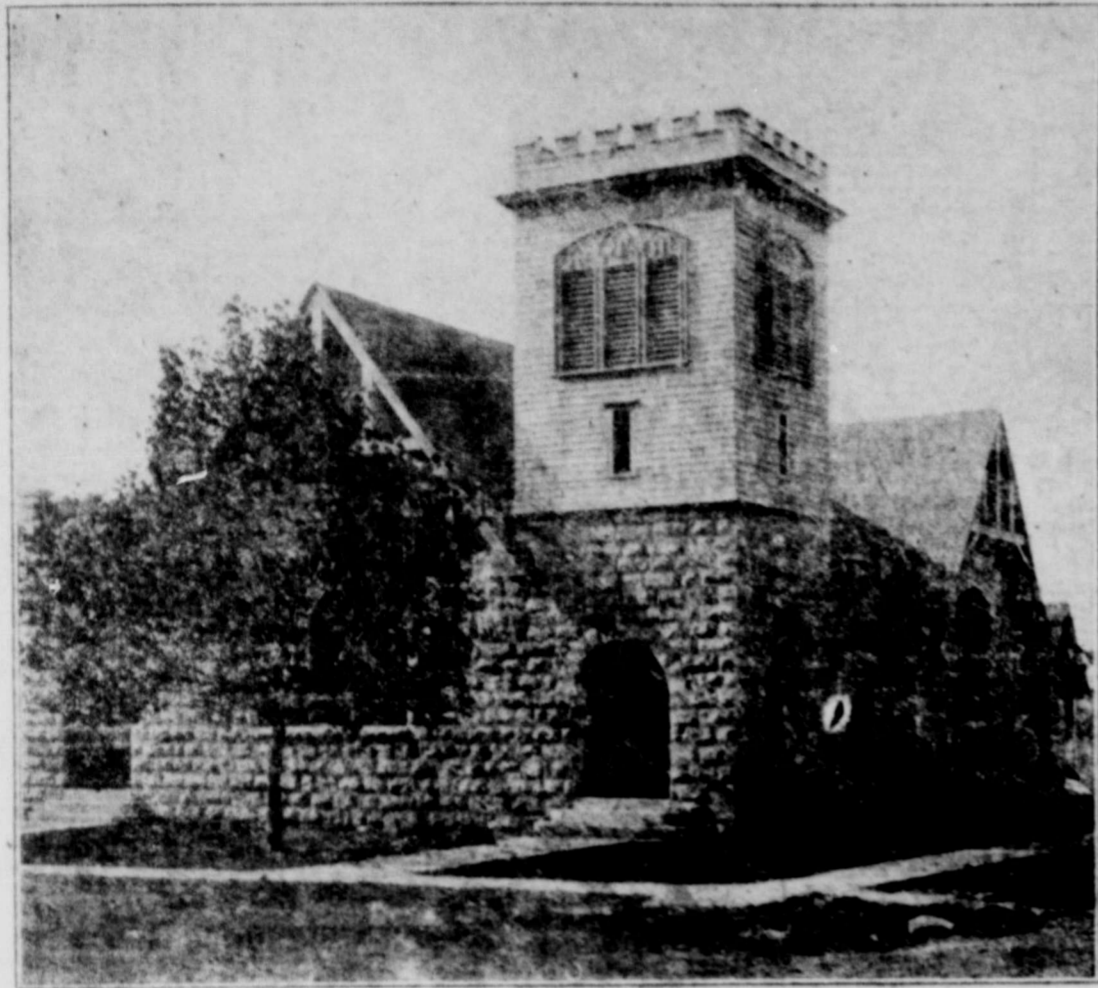
The Church of the Nazarene in Ballinger, one of the substantial church buildings of this city. The present home of the Nazarene Church has been acquired during the past year, and is one of the marks of the rapid growth of the church in this city.