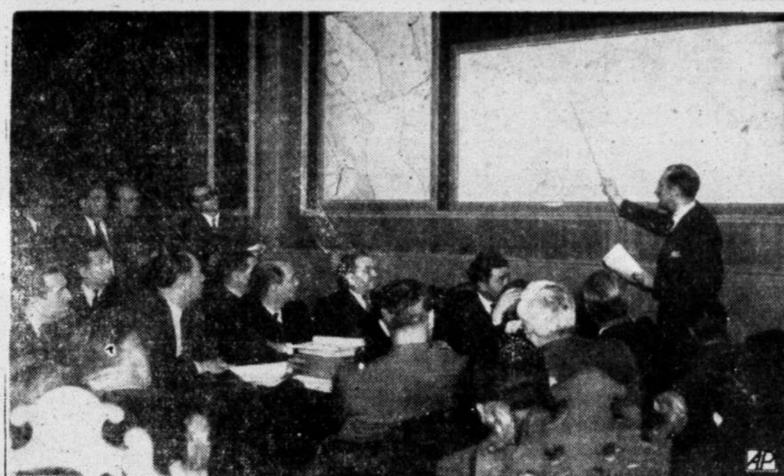
U. S.-MEXICO WATER TREATY EXPLAINED —Adolfo Orive Alba, chief of the Mexican irrigation service, is shown explaining the U. S.-Mexico Water Treaty to the Mexican Senate Foreign Affairs Commission at the public hearing in Mexico City July 31.

Charm-King SUPREME COLD WAVE HOME KIT Each kit contains 3 full ounces of Salon-type solution with Keratin, 60 Cutters, 60 end tissue, cotton applicator, neutralizer and complete instructions. Takes only 2 to 3 Hours of Home MORRIS PHARMACY 76-91 T pd