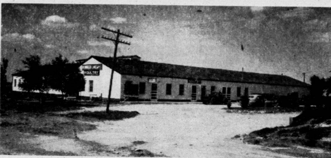
Efforts of the poultry division of Henningsen Lamesa, Inc., are diverted toward supplying army camps with high quality meats. The poultry unit is equipped to care for fowls under ideal conditions. Grade 1 birds are purchased, mash fed, dressed in accordance with state and federal pure food laws, then chilled and packed and sent to army camps. The birds supplied by Henningsen Lamesa, Inc., are of a choice quality, affording tender, delicious meals.