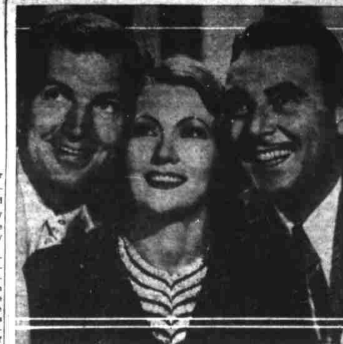
IN ADVENTURE STORY —A tale of intrigue and adventure, with diamonds involved, is that told in "Adventure in Diamonds," playing today and Monday at the Queen. Featured players are John Loder, Isa Miranda and George Brent.