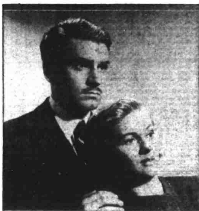
STRONG CHARACTERS —Characters as vivid as any created in fiction in many years are those conceived by Daphne du Maurier in the best-selling novel, "Rebecca," which has been made into a screen piece and which plays today and Monday at the Ritz theatre. The parts are those of Maxim de Winter and his second wife, portrayed by Laurence Olivier and Joan Fontaine.