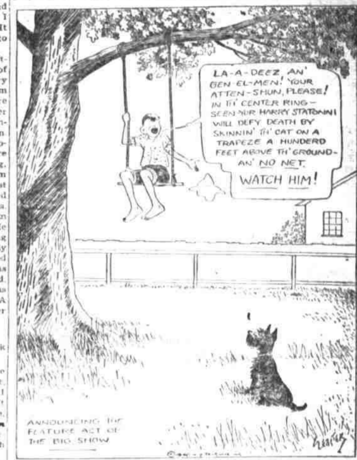
ANNOUNCING THE FEATURE ACT OF THE BIG SHOW

all he was living again over the lines had plotted 2000 plants on test flights and laid out more than once when a wing gave way.