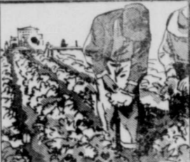
Lettuce is now wrapped in the field.

Lettuce cut and trimmed in the field reaches the heat-sealer crisp, moist, and with color intact. Each head is trimmed and ready for sale.