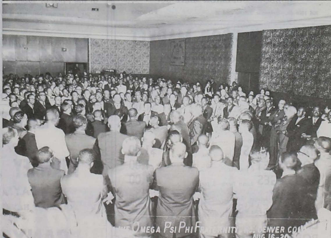
Pictured above are the 450 brothers at the 49th Grand Conclave Omega Psi Phi Fraternity Inc. Denver Colorado August 16-20, 1964

The Dunbar Panthers are really like another state champion team. They are up and ta it each morning and working hard each afternoon five days a week. It will not be long before we can go out and see our boys in action ... lets