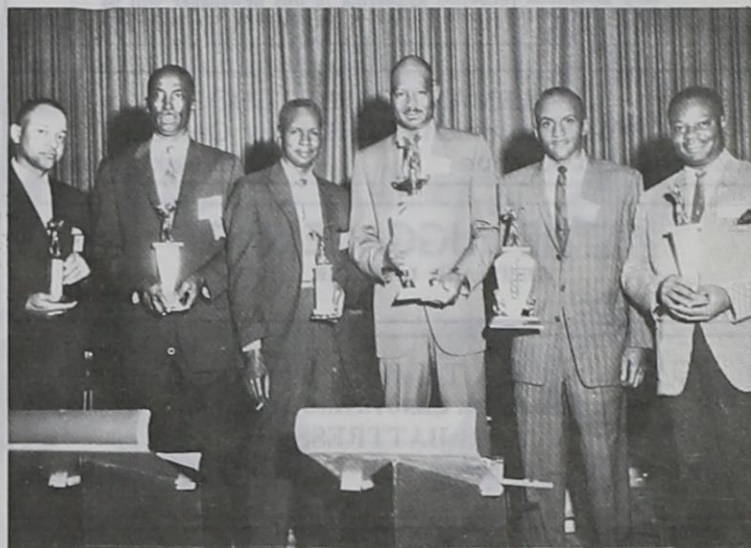
ΩΨΦ 49TH GRAND CONCLAVE OMEGA PSI PHI FRATERNITY INC. DENVER COLO. AUG. 16-20, 1964

The brothers who had a hard trip up the mountain to Denver, but the