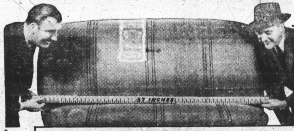
See how the BIG NEW FORD outmeasures the "other 2"!

Meet the Man with the "MEASURING STICK"... He'll show you exactly how the Ford outmeasures the "Other Two" where Extra Roominess really counts!