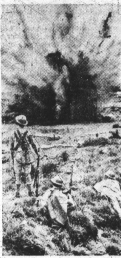
Sappers of Fifteenth Royal Australian engineers explode a land mine by fuse, during maneuvers near Sydney, Australia. Tactics such as this were responsible for destroying Italian land mines, opening the road for British tanks on the way to Bardia, Tobruk and Derna.