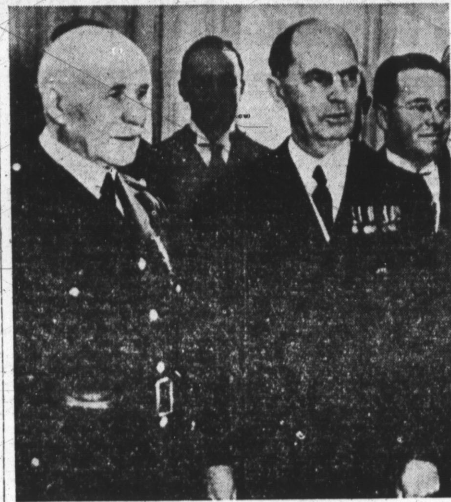
Admiral William Leahy, U.S.N., the newly appointed American ambassador to the French Vichy government, is shown in this picture, at the right, with Marshal Philippe Pétain, French chief of state, as he was welcomed to Vichy on his arrival there to take up his official duties.