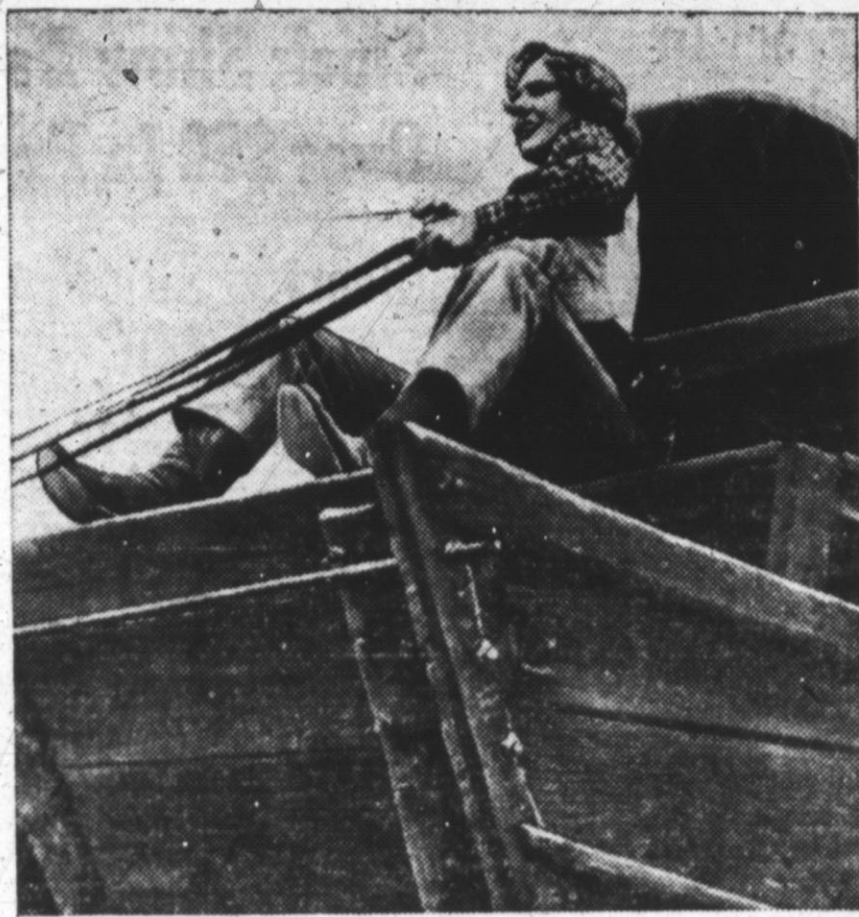
Jean Parker as the first white woman in Arizona turns that stronghold of manhood upside down in the movie by the same name which comes to the Star Theatre screen Sunday and Monday. But when she met William Holden—well he was one kind of man she didn't know how to handle. Also in the film are William Warren and Porter Hall.