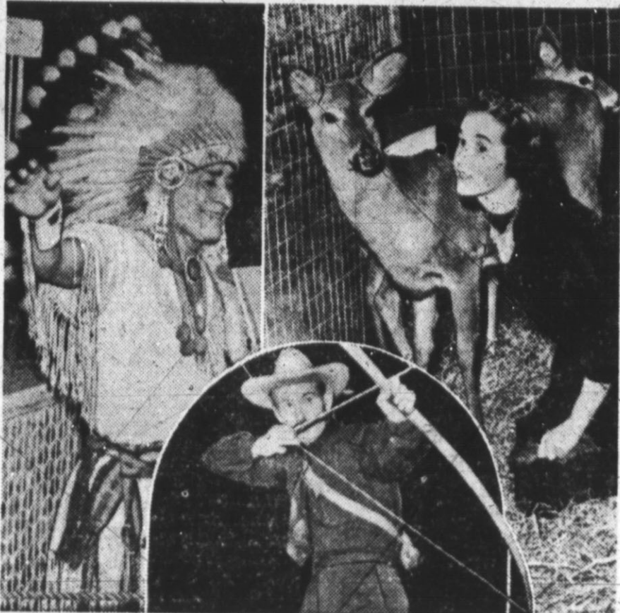
Chicago will present its annual preview of outdoor sports February 22 to March 2, at the International Sportsmen's show. These pictures, taken at last year's show, are typical of what is coming. Indians from a number of tribes will add color to exhibits, wildlife will become friendly, and the bow and arrow will be exhibited in competitive events.