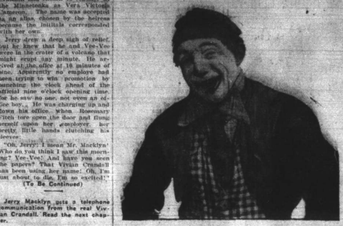
From what source are the "jests" of the circus recruited—in other words, where do the clowns come from? Not an easily answered question by the experience of circus men, for the manager seldom if ever keeps tabs on that matter. All clowns are the "merry Andrew" who can make patrons laugh and remember. But a canvass of any circus will reveal that they come from every walk of life and that their homes are as far scattered as are the constellations of this big country.