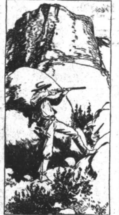
Jim's Rifle, Already Raised, Swerved a Trifle—Cracked. The Hat Went Flying.

Smoky came panting in with Hays' pack, and started off again. "That's enough, Smoky," called Jim. Slocum returned. "Nothin', left—'cept Hank's bed," he panted. "I couldn't locate thet." "Listen!" "What do you hear?" "Hosses." "Jim, keep your eye peeled on the cliff," said Smoky, and stole forward under cover of the brush. Presently a white puff of smoke showed above the ragged rim. Spang! The fight was on. One of Hays' men—Bridges—let out a hoarse bawl and swayed over, almost losing his balance. Jim looked no more at him, but concentrated his gaze on the rim. Another puff of white! Something dark—