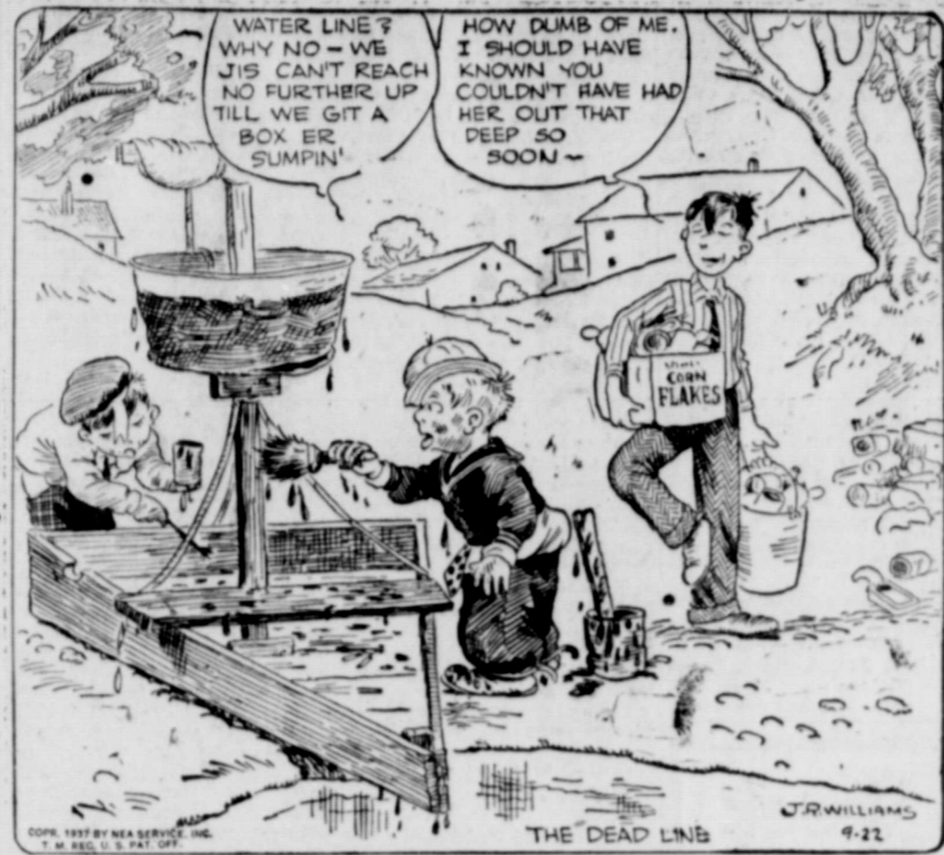
THE DEAD LINE 9-22