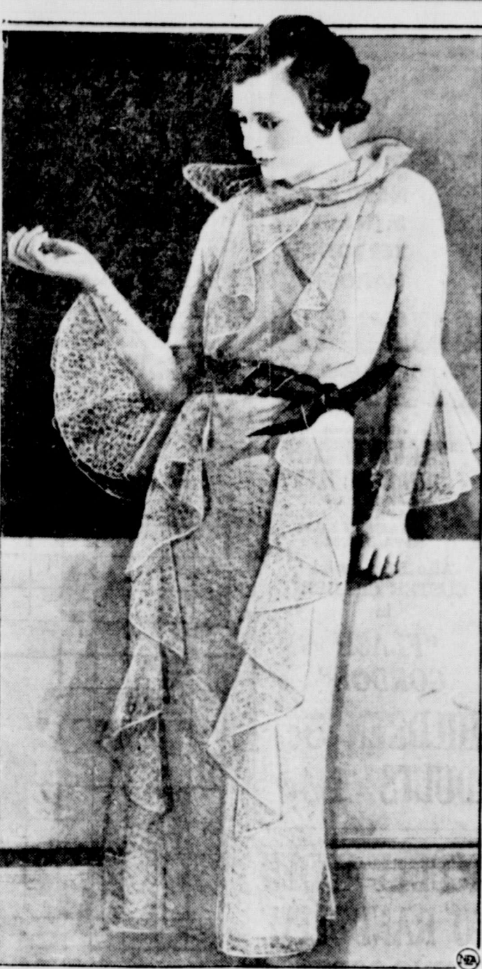
Typical of the charm prevalent in Paris' midseason collections is this lovely evening gown of natural colored lace, designed by Barton. It has long, flattering sleeves with wing effects between cuffs and elbows. The double flounce trimming is edged with satin to match the shade of the lace. A vivid red, green and yellow plaid belt supplies the color contrast.

There Is No Substitute for PAID Circulation