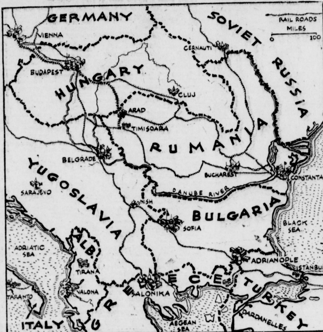
Balkan map illustrates transport difficulties for large German forces reported moving into Rumania. Only one railroad runs through Hungary and into Rumania without cutting into a third country. Arad and Timisoara are new headquarters for Germans.