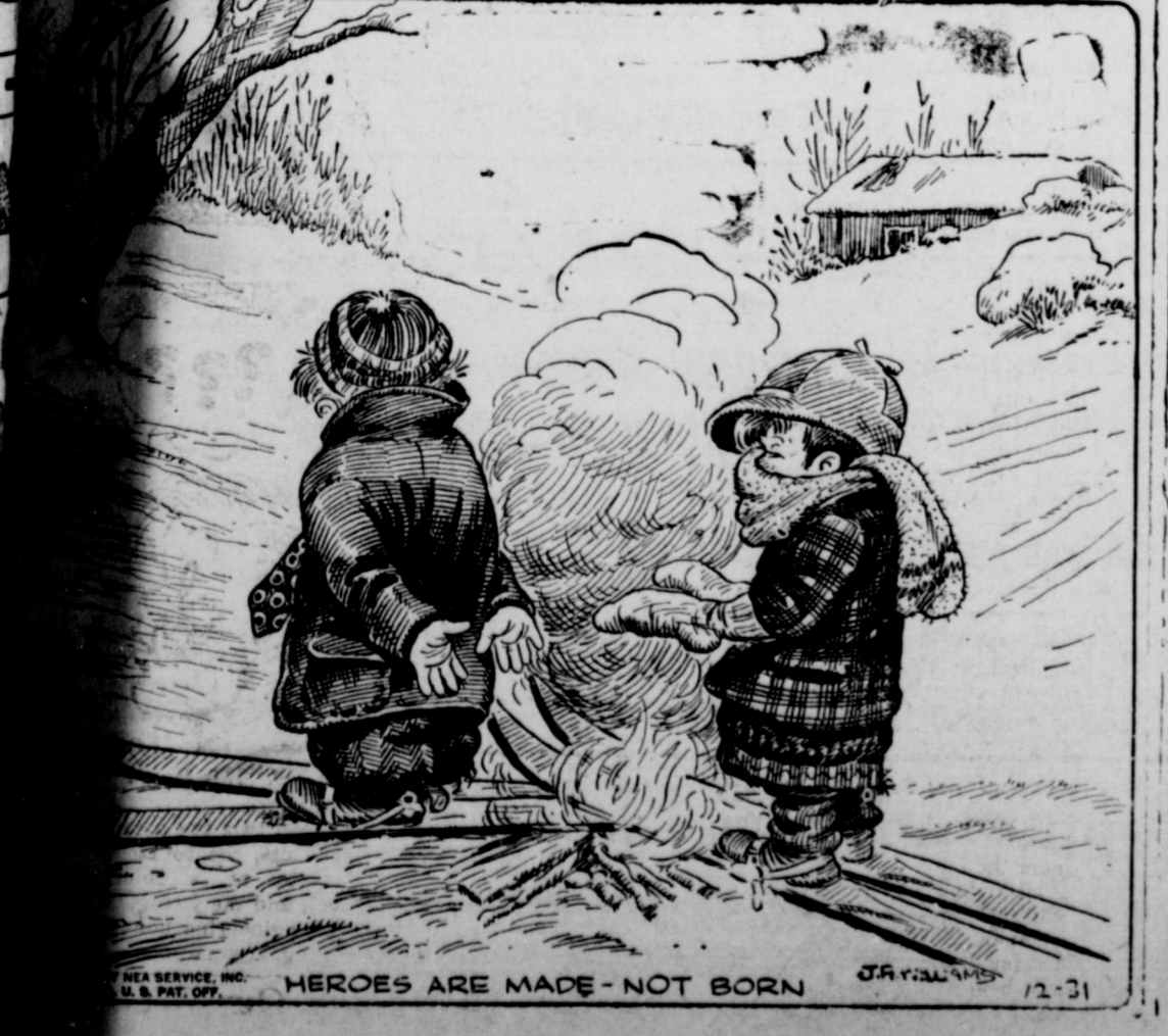
HEROES ARE MADE - NOT BORN