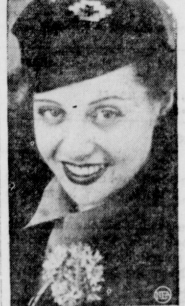
Lucienne Boyer above, popular cabaret singer, is reported under arrest in Paris on charges of evading food supply restrictions by smuggling food to theatrical folk in boxes labeled "Shampoos."