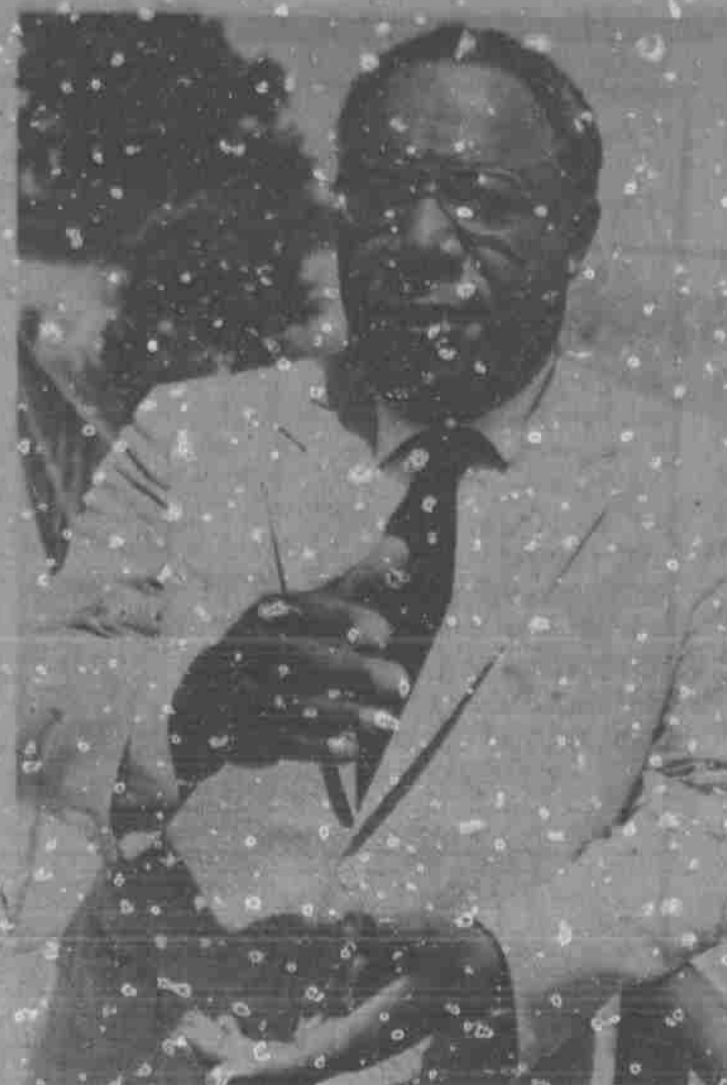
Still (left) broke new ground as a classical music composer in the 1930s and 1940s. This program will be seen over KXTV-TV, Channel 5, PBS, February 25th, at 9:30 p. m.