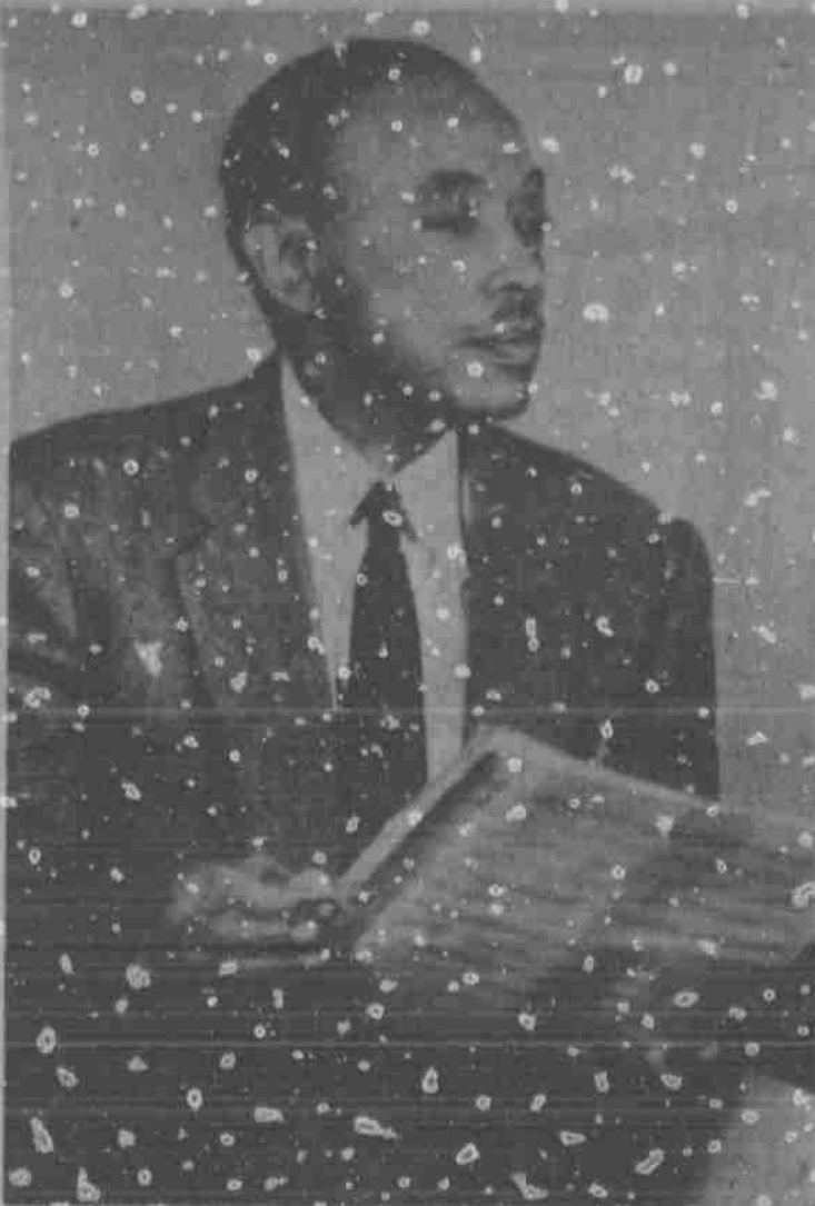
Alex Haley (right) hosts and narrates WILLIAM GRANT STILL TRAILBLAZER FROM THE SOUTH, a musical profile of the "dean of American black composers." William Grant