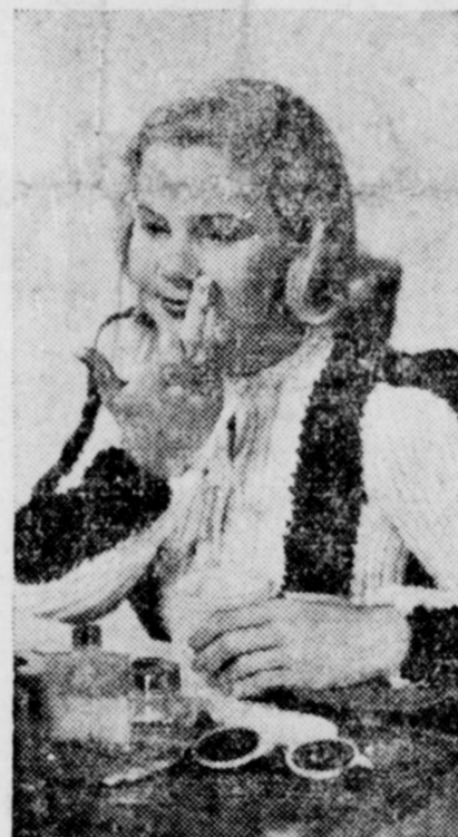
June Preisser, who will soon be seen in "Gallant Sons," takes time out from her screen chores to show how easy it is to protect beauty from winter blasts. It isn't so easy for the tip of the nose to become cold and numb if you remember to rub some cold cream around the skin before powdering.