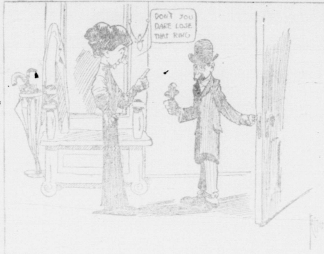
(Copyright, 1911.) New Jersey Matrons Demand a Law Labeling Married Men With Thumb-Rings—News Item.