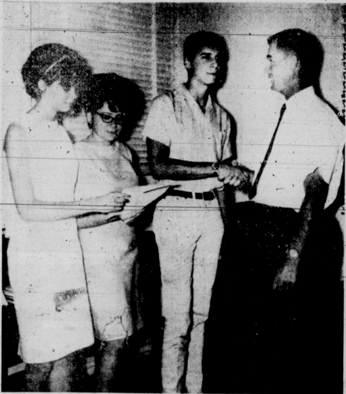
High Ranking Students

$5 Per Year in Mitchell County — 10c Per Single Copy