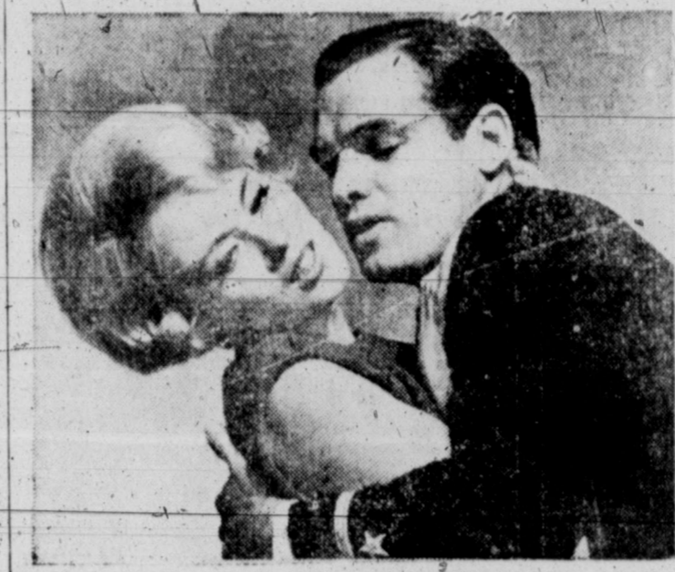
Starts Sunday JEAN SEBERG stars in the technicolor drama "Moment to Moment" Sunday through Tuesday at the Palace Theatre. Also, starring are Honor Blackman and Sean Garrison. Music for the production is by Henry Mancini.