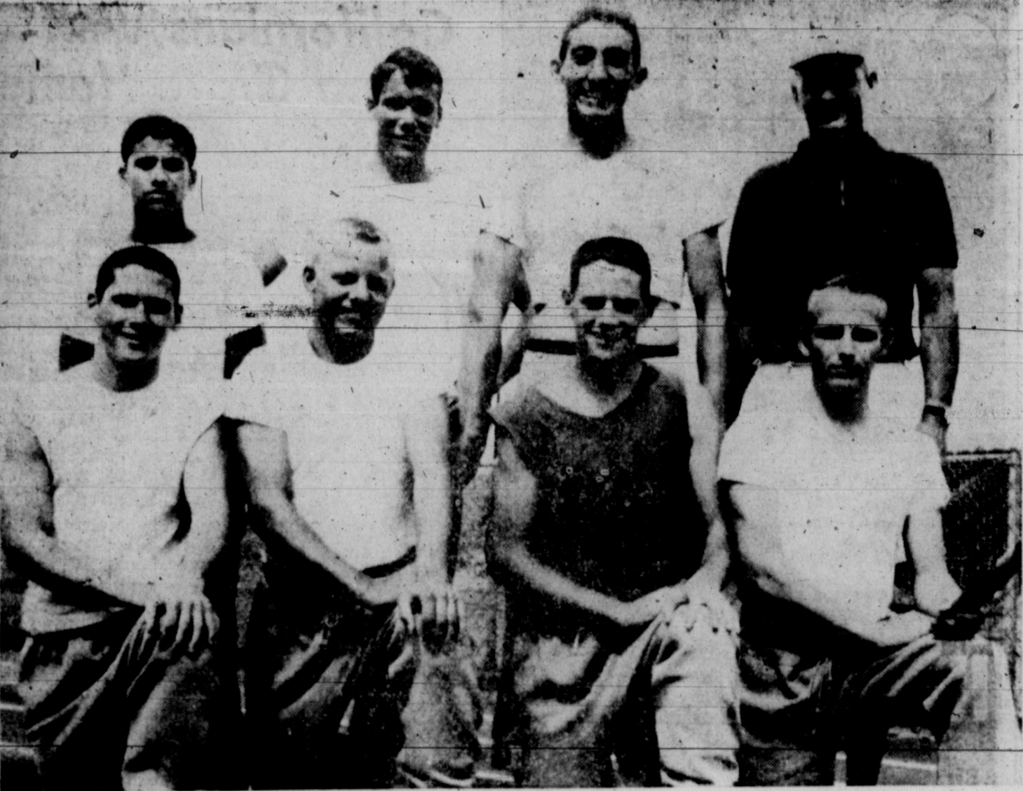
Regional Meet Bound

SEVEN MEMBERS of the Colorado High track squad will compete in Lubbock Friday and Saturday in the regional meet. Those going are members of the sprint and mile relay teams and broad jump-