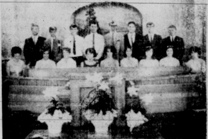
Youth Week At Westbrook