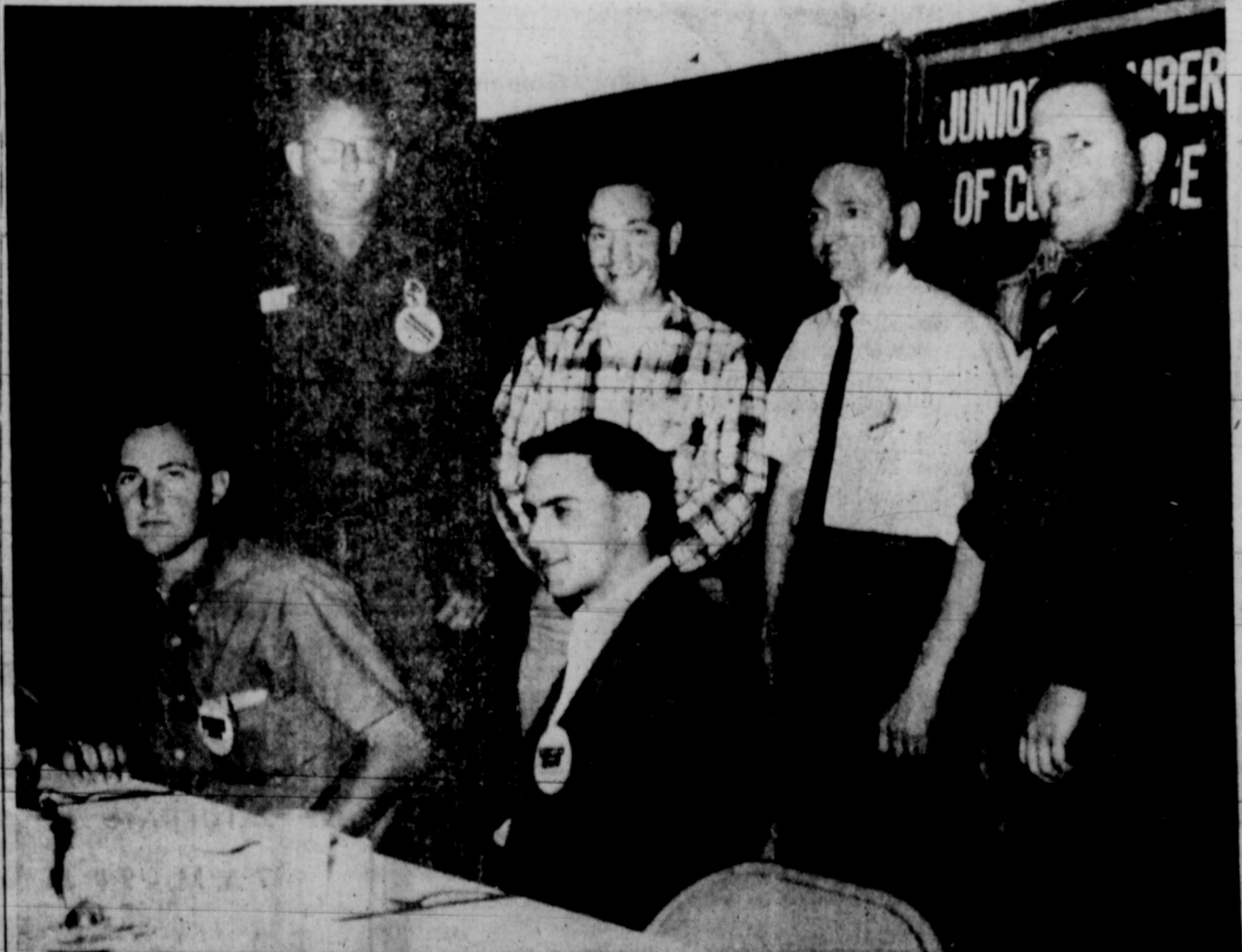
New Jaycee Slate