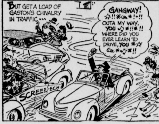
The Travelers Safety Service

The use of courtesy on the highways could drastically reduce the number of casualties.