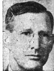
By DICK O'BRIEN