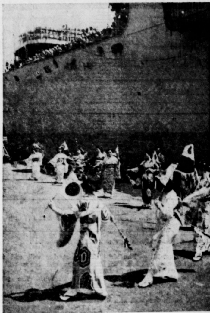
DANCING LADIES—When the USNS Gen. William Weigel reached Yokohama, Japan, about 3000 U. S. soldiers peered over one side to see 30 of the country's loveliest gals do a welcome dance. After 12 days at sea the boys, who are Army and Air Force replacements a long, lonely way from home, were made somewhat happier with the gay and unexpected reception.