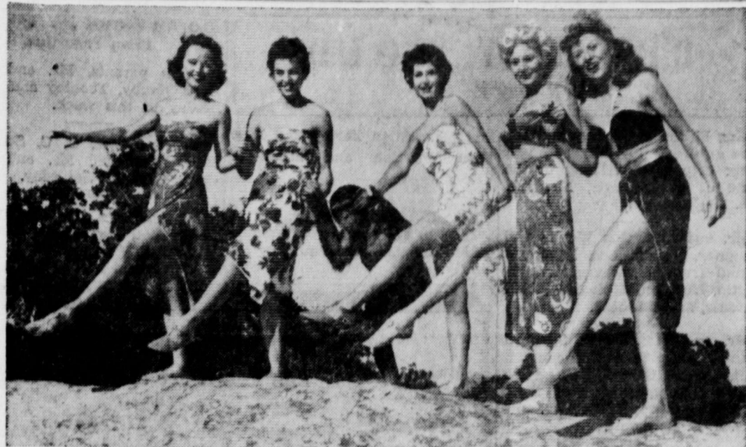
A SAMBA FOR TAMBA—On a movie set in Hollywood, some of the jungle beauties appearing with Johnny Weissmuller in "Voodoo Tiger" are teaching Tamba, a simian star also in the film, a few dance steps. Tamba doesn't dance in the picture, but the lessons were fun.