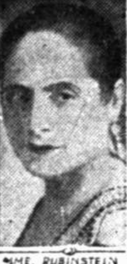
Mrs. Helena Rubinstein