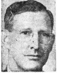
By DICK O'BRIEN