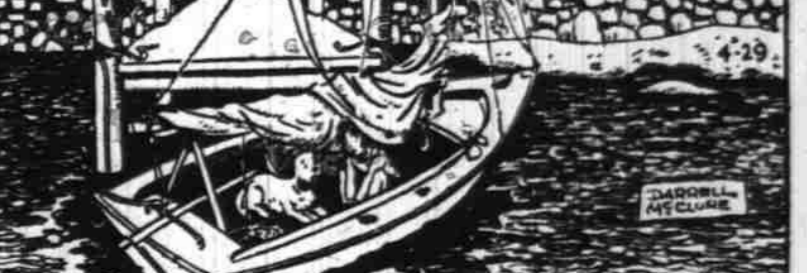
GEE, ZERO I GOT THE WIM WAMS-I DON'T KNOW WHAT TO DO-THAT CRUEL-LOOKING WOMAN THAT SEZ SHE'S MY MOTHER, AIN'T MY MOTHER-AUSE MOTHERS ARE NICE PEOPLE-