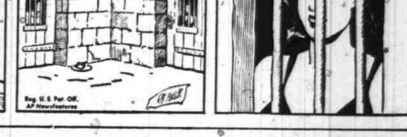
NO!-I CONTACTED NO OTHER CRAFT...SOMEVUN WITH A RADIO IS PLAYING JOKES!