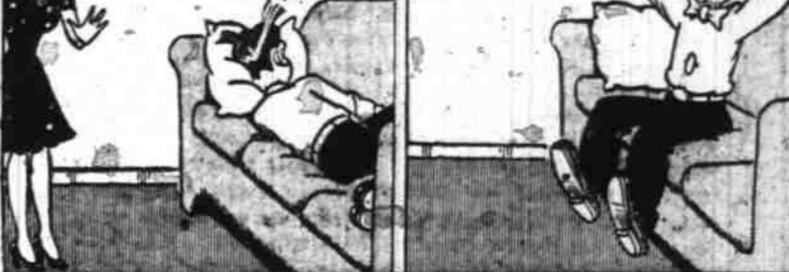
COME, DAGWOOD, I LET YOU SLEEP FOR AN HOUR AND NOW YOU HAVE TO HELP ME!