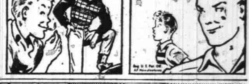
AREN'T YOU GOIN' TO HELP ME?