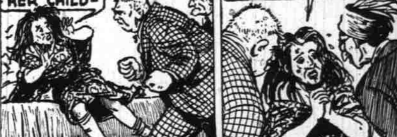
PLEASE-PLEASE-DON'T TORTURE ME NO MORE-I'M NOT LYING-THE LADY SAID I WAS MISTAKEN-SHE'D SHOW ME HER CHILD.