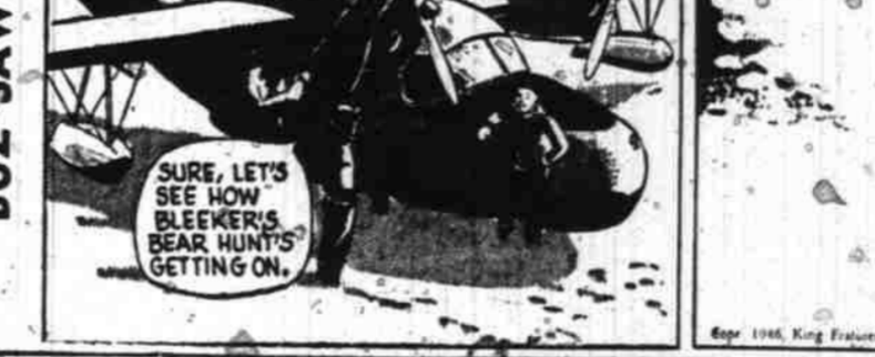
TELL YOU WHAT, SAWYER, INSTEAD OF SITTING AROUND, WAITING FOR BLEEKER TO GET BACK, MAYBE YOU'D LIKE TO LOOK AT A BIT OF GREENLAND FROM THE AIR.