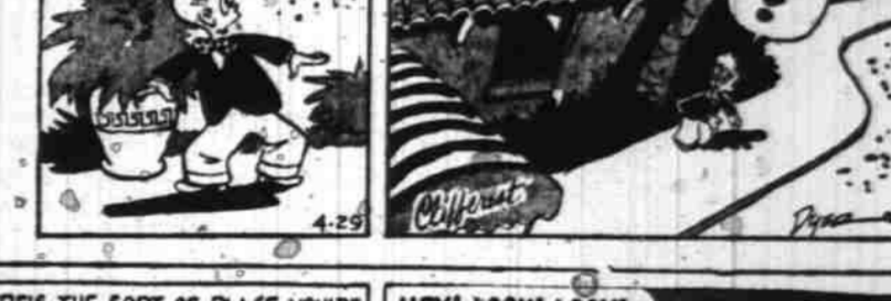
TOTH ME OUT ON MY EAR, WILL THEY? WELL I DON'T GIVE UP EASY!