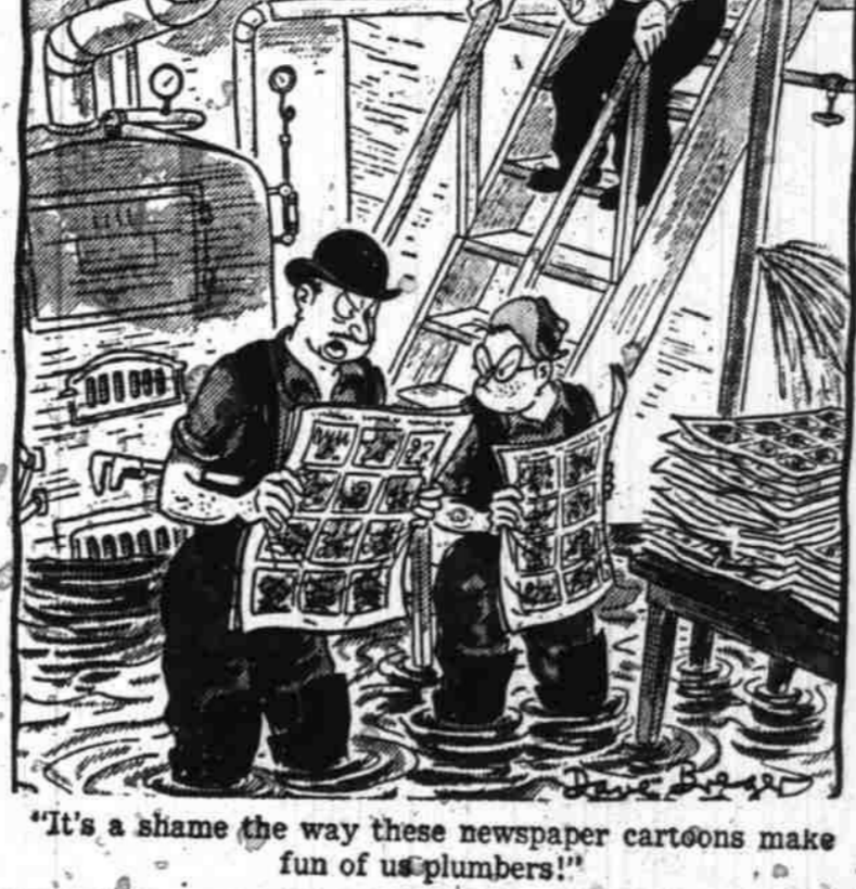
It's a shame the way these newspaper cartoons make fun of us plumbers!