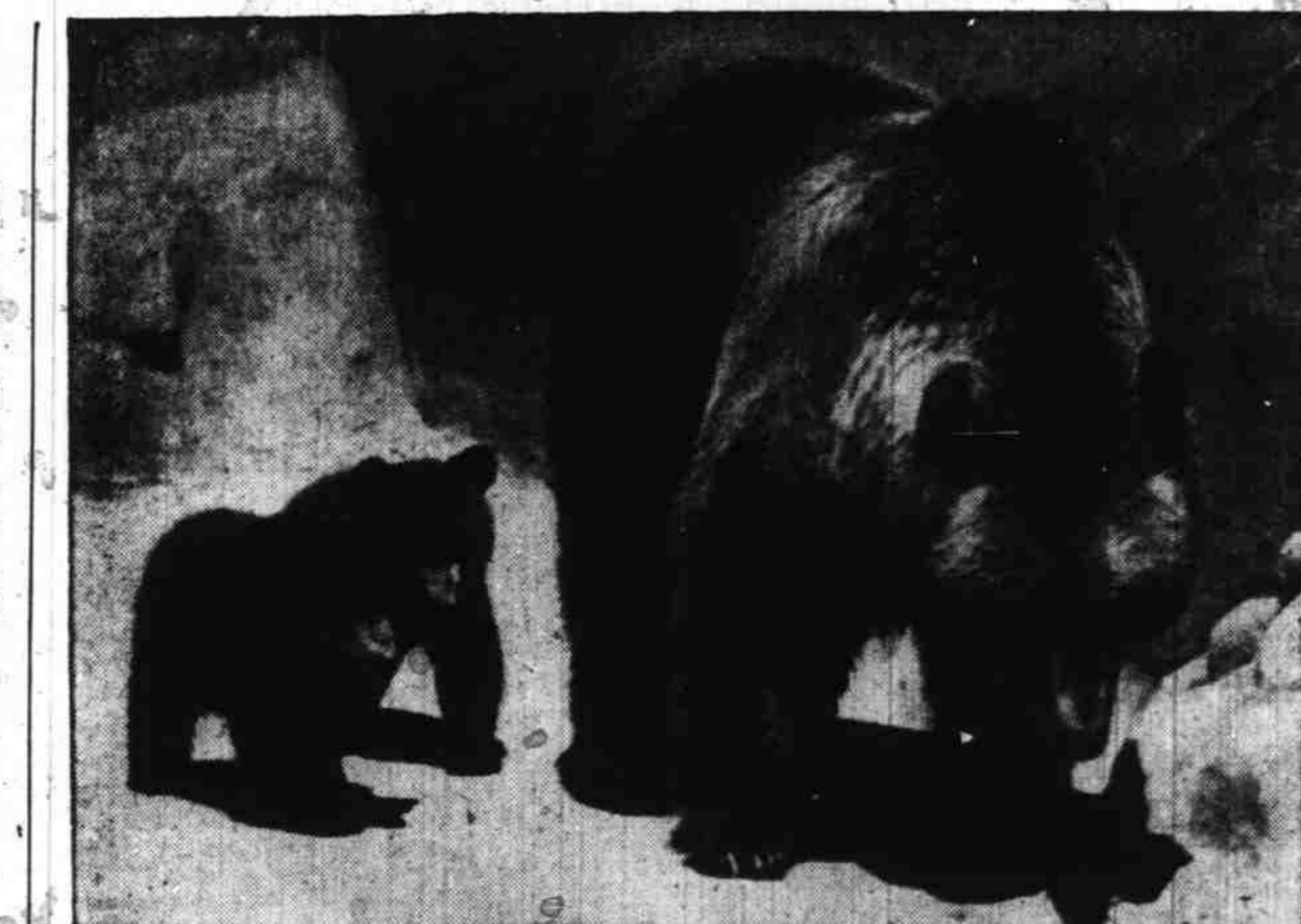
AFTER LONG WINTER'S NAP — Twin European brown bear cubs, born last December 18, follow their mother into the open for the first time at the San Diego, Calif., zoo.

Coal is a source of vitamins, sulfa drugs, rubber, fertilizers, paints, insecticides, and disinfectants.