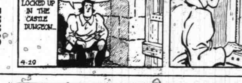
A FINE HOWDY-DO! I DIDN'T EVEN GET A CHANCE TO FIND OUT ABOUT LADY LORINDA!