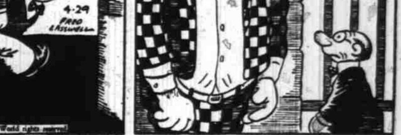
IF ENNYTHING HAPPENS, WARDEN, CAN I GIT MY OL' NUMBERS BACK?