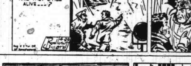
SCORCHY SEEKS A WAY TO AD THE SENATOR AND HIS DAUGHTER WHO TRY TO PANCAKE ON STORMY HALF LOAF MOUNTAIN! ARE THEY STILL ALIVE...