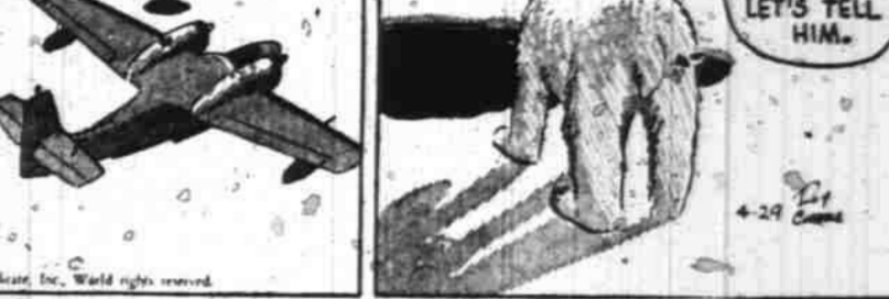
I GOT SOMETHIN' I WANNA TELL YA SWEETS!