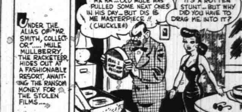
UNDER THE ALIAS OF "MR. SMITH," COLLECTOR "MULLER" MULLIBERRY THE RACKETEER HIDES OUT AT A FASHIONABLE RESORT AWAITING THE RANSOM MONEY FOR THE STOLEN FILMS...