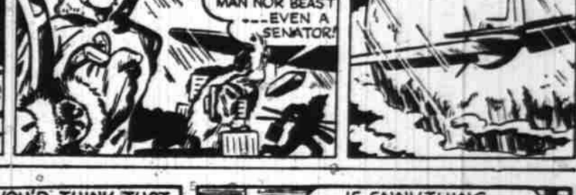
YOU'D THINK THAT AFTER 20 YEARS HE'D HAVE A CRAW ELL OF THIS JOINT