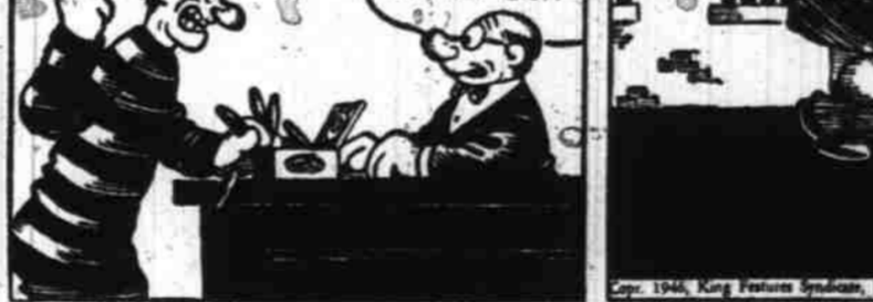
RAZORBACK SMITH IS OUTSIDE TH' MAIN GATE ASKIN' FOR YA.