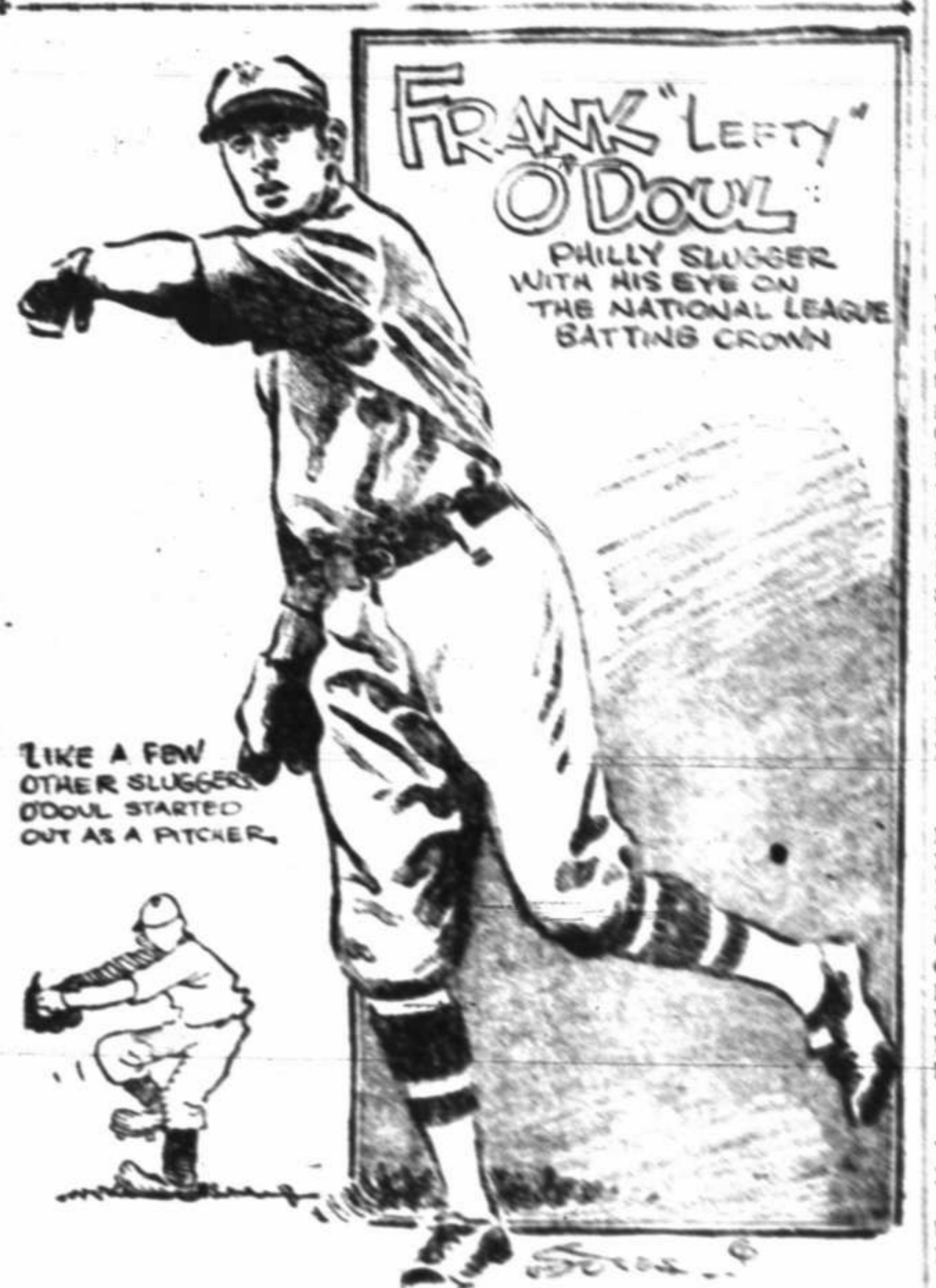
FRANK 'LEFTY' O'DOUL PHILLY SLUGGER WITH HIS EYE ON THE NATIONAL LEAGUE BATTING CROWN

SPORTS CARICATURIST: Write For Central Press FRANK 'LEFTY' O'DOUL, Philly outfielder, must look back with great satisfaction on the way 1927 ordinarily under the same circumstances the average ball player wouldn't, for that season O'Doul landed with the Salt Lake City Coast league team after being released by the Boston Red Sox. But for Lefty it was the turning point in his career. He gave up pitching and became an outfielder—and ambition he had nursed for a long time.