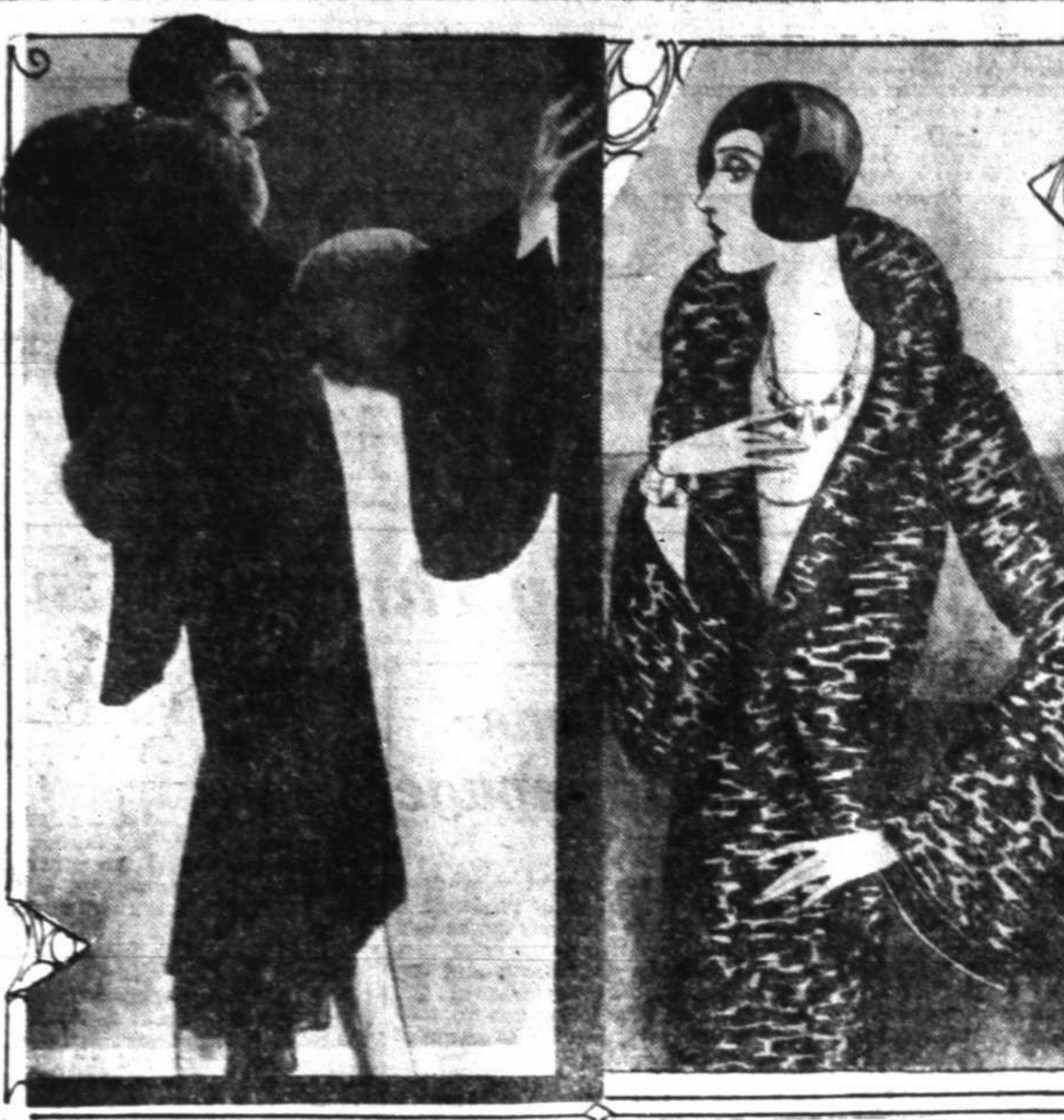
The dark lady of the sonnets—the beautiful brunette—is a joy to the creative dressmaker, declares Lucien Lelong.