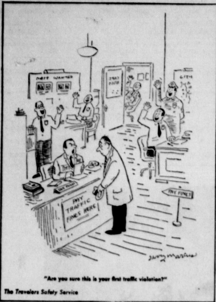
Speeding and reckless driving were involved in accidents resulting in 25,000 deaths in 1966.