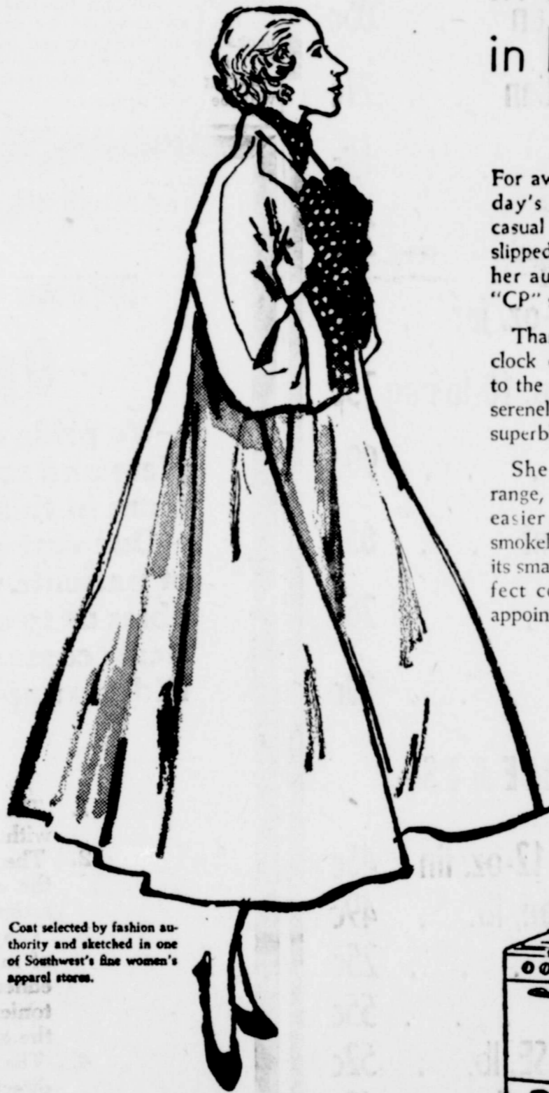
Coat selected by fashion authority and sketched in one of Southwest's fine women's apparel stores.

For away-from-home activities today's smart woman slips into a casual flaring coat...having already slipped a complete oven meal into her automatic gas range built to "CP" standards.