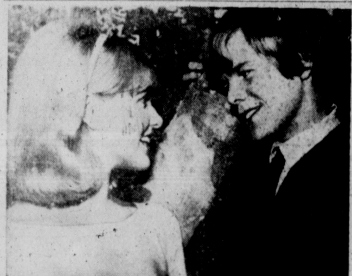
Holiday Fare At The Palace

THAT'S an acrostic, children, is if you didn't know. An acrostic is a verse, or arrangement of words in which first letters in each line spell out words—or a motto. JULY FOURTH. That's tomorrow, Monday, July 4, 1966. One hundred plus 90 years since the "Spirit of '76." And may the spirit of '96—1966, that is, hold it dear. Remember reverently how this Nation came into being. If through no fault of your own, or circumstances beyond your control, you can not keep the day as a Holiday, at least take time to re-read the pure poetry of the Bill of