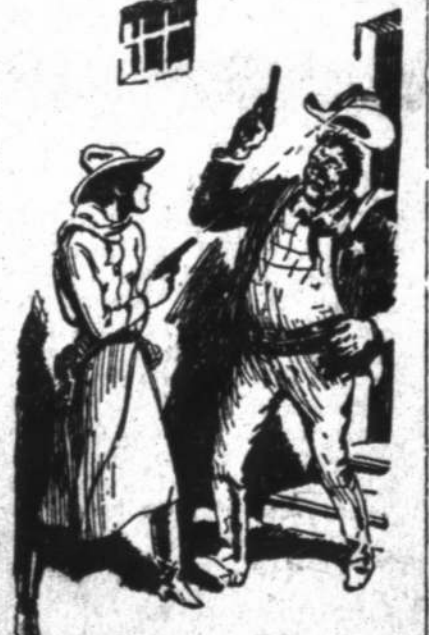
She Brought Her Gun Up and Fired.