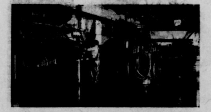
2. Oil pipe lines have worked wonders in oil transportation to carry your record demand for oil. This is the interior of Humble Pipe Line Company's pumping station at Comyn. This company operates 8,703 miles of oil and finished products pipe lines in Texas and New Mexico. Though construction of additional pipe lines has been slow because of the high demand for steel for other purposes, the Humble Pipe Line Company has been able to handle the largest volume in its history; during 1947, main trunk lines delivered 253,000,000 barrels of oil.