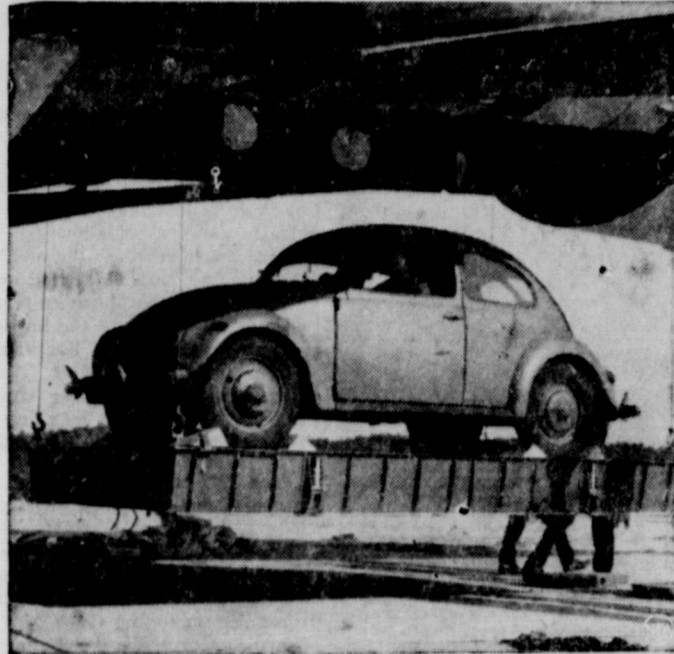
A small automobile is lifted into the huge C-74 Globemaster, now taking part in the air lift supplying Berlin. The car was flown back to Frankfurt on the mammoth cargo carrier's second return flight. The sky giant had carried a complete rock-crushing plant to the beleaguered German capital.