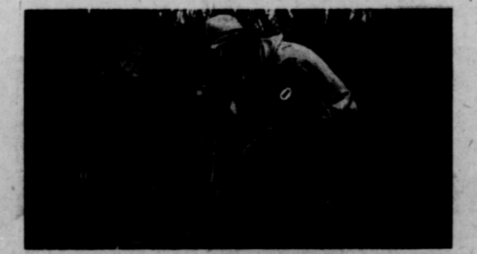
3. The oil industry's efforts to find more oil for you have greatly increased the activity of scientific exploration. This picture of Humble geophysical exploration in the Louisiana swamps illustrates the difficulties field crews encounter. It is more difficult—and expensive—to drill wells in areas like this; engineers must solve construction and supply problems before drilling operations can even be considered.