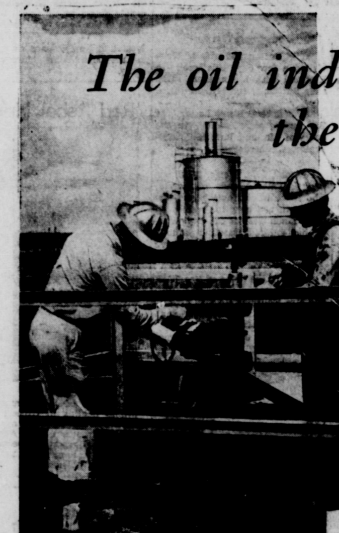
1. This is the "Christmas tree" you've heard oil men talk about. It is a complicated arrangement of valves and meters which regulate the flow of oil from a producing well. This well is on Humble's lease in the Conroe field in Texas.

placed on the north side of the shower room is lined with sheet iron. There are 10 showers (formerly the boys had only 4). A concrete floor replaced the one left