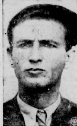
Gen. Markos Vafalades, above, commander of the Communist armies fighting in Greece, has been wounded in action, according to dispatches from Athens. Vafalades is reportedly recuperating in a hospital in Tirana, Albania.