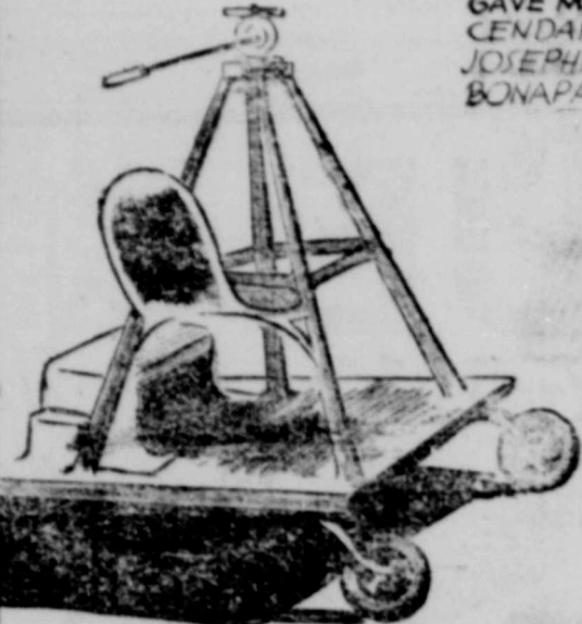
A "DOLLY" IN THE COLUMBIA STUDIOS IS NOT A TOY, IT IS THE NAME GIVEN TO THE ROLLING PLATFORM ON WHICH THE CAMERA IS MOUNTED FOR MOVING SHOTS

THERE ARE ALMOST 13,500 MOTION PICTURE HOUSES OPERATING IN THE U.S. OVER 97% OF THESE ARE EQUIPPED FOR SOUND