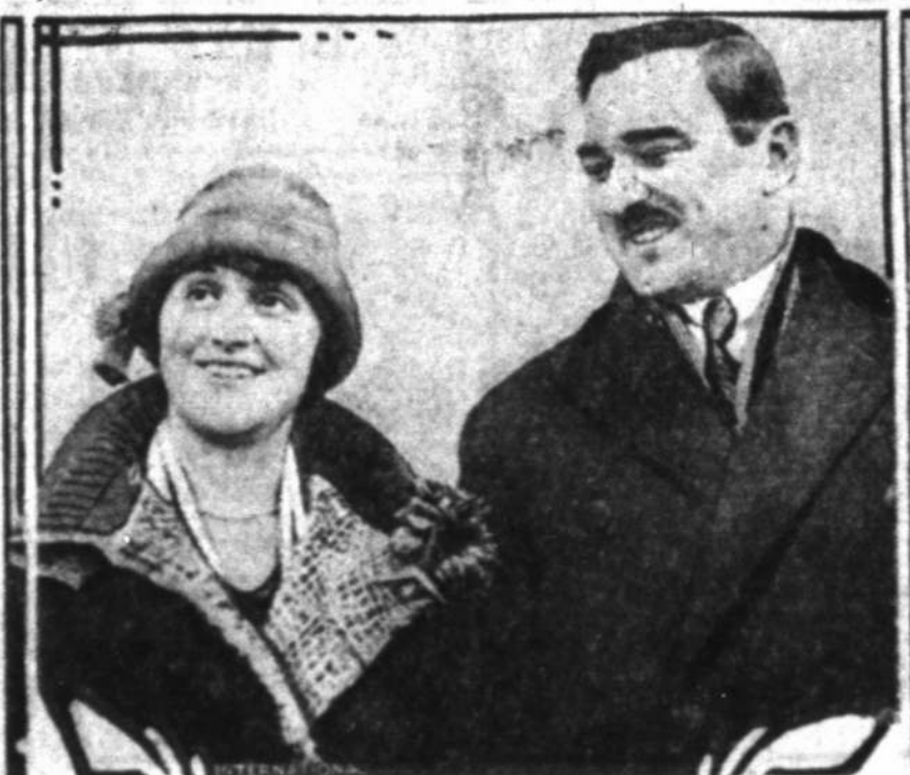
Yugo-Slavian's commission to settle the debt to the United States has arrived in Washington. Its seven members are headed by Dr. M. Stojadinovich, minister of finance, who is shown above with his wife.