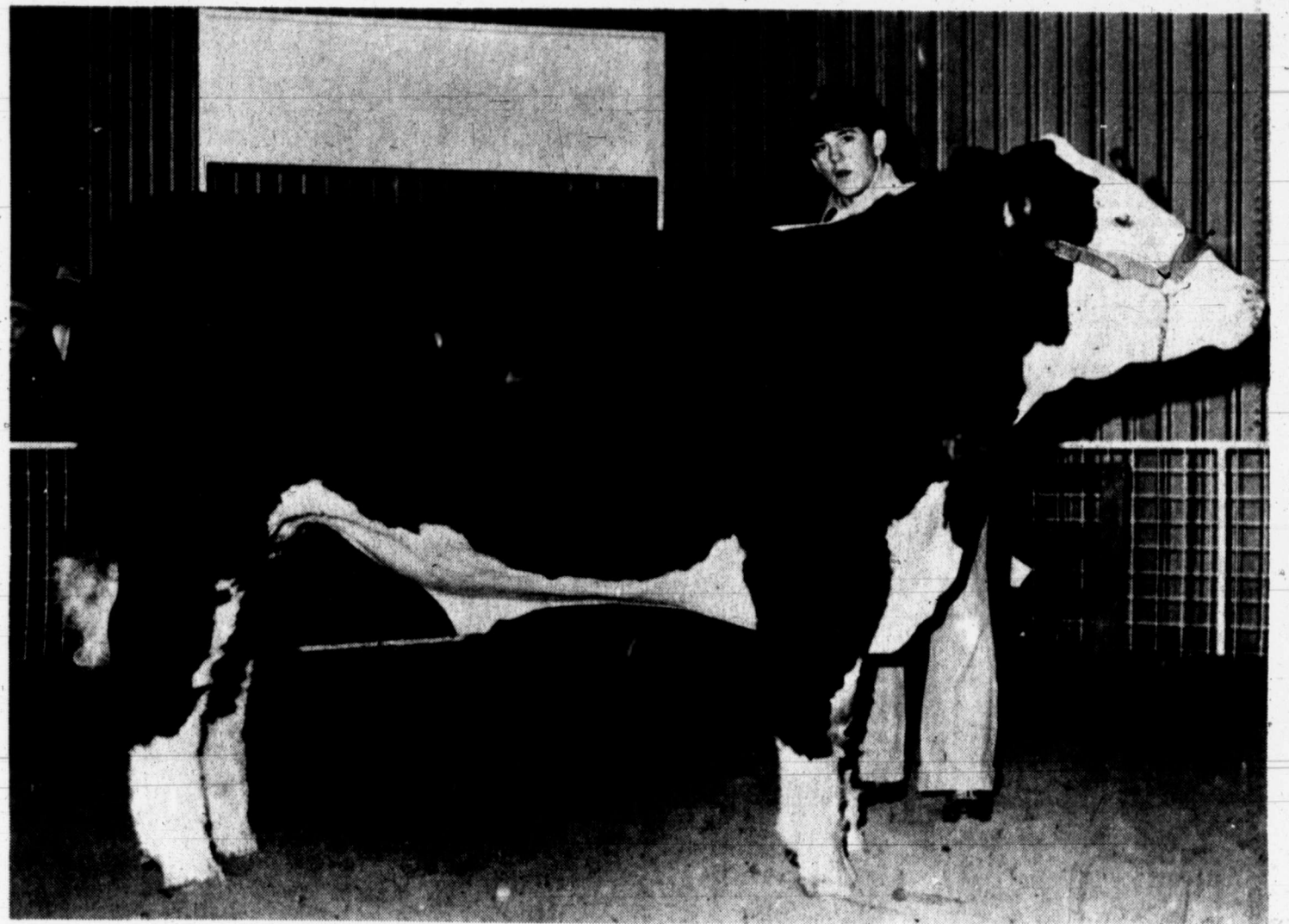
El Paso Grand Champion