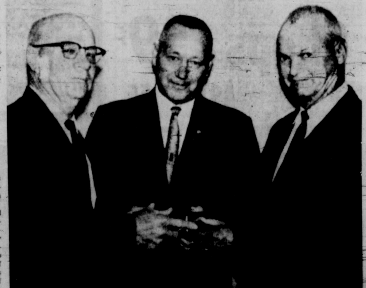
20-Year Service Awards