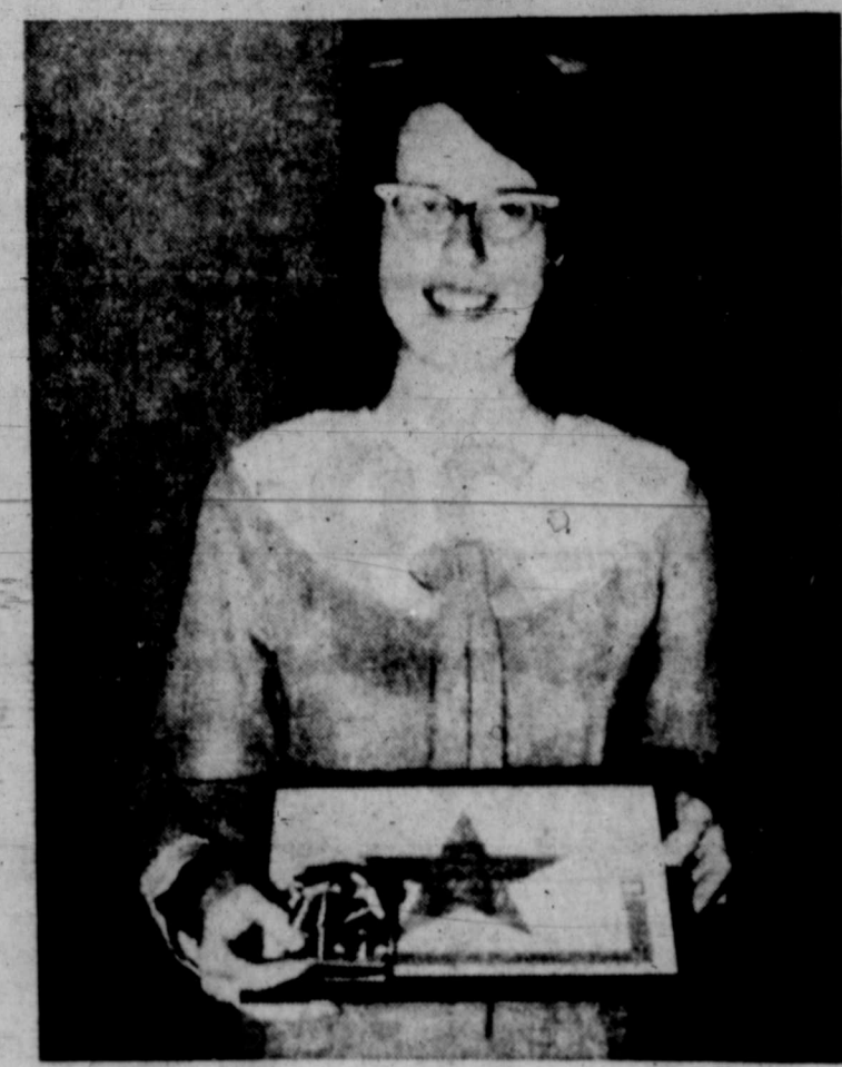
from the South Plains. The Gold Star youths were cited for personal development, outstanding achievement and results in demonstrations, special contribution to 4-H on local and district levels.