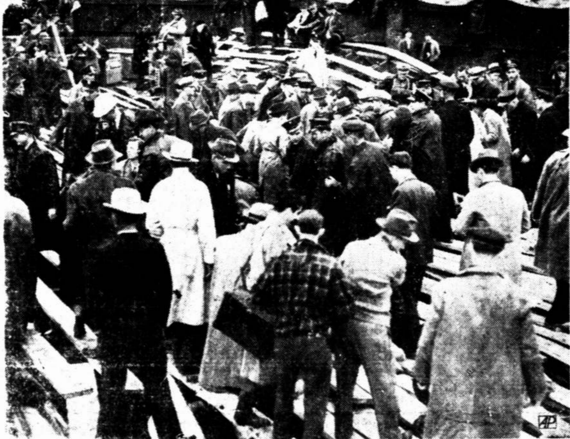
The section of temporary bleachers that collapsed during the Texas A. & M.-S. M. U. game at Dallas last Saturday, injuring a number of spectators, is shown above as victims were still being pulled from the timbers. No serious injuries were received, but many bruises and broken bones were received by the fans.